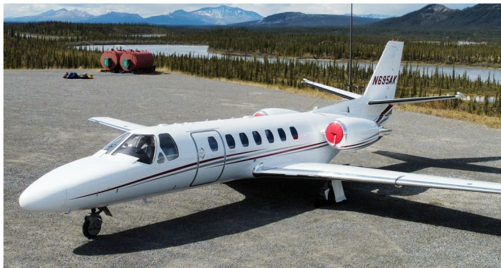
Cessna Citationjet V Ultra (560) Intake Plugs, With Pylon Plugs

The Engine Inlet Plugs are custom fit for your Cessna Citationjet V Ultra & Encore Models intakes, made with heavy-duty vinyl material, and stuffed with a single block of sculpted urethane foam. Each plug has a zipper that allows the foam to be removed and dried if necessary. Engine plugs have 'remove before flight' streamers sewn onto the face of the plugs. Most plugs are imprinted with the aircraft registration number in black for an extra charge. Storage bag NOT included. Engine plugs may be inserted after flight when the engine is still warm. Engine Inlet Plugs are commonly referred to as Cowl Plugs, Intake Plugs, Cowl Blocks, Engine Blocks, and Engine Bungs.