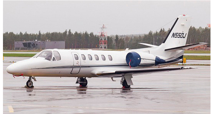
Cessna Citation Bravo Engine Covers and Pitot Covers sets