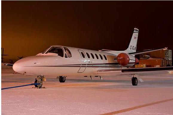
Cessna Citation 550 Engine Cover Set

The Cessna Citationjet V Ultra (560) Intake/Exhaust Plugs are custom fit for the intake and exhaust openings, made with heavy-duty vinyl material, and stuffed with a single block of sculpted urethane foam. Each plug has a zipper that allows the foam to be removed and dried if necessary. Engine plugs have 'remove before flight' streamers sewn onto the face of the plugs. Most plugs are imprinted with the aircraft registration number in black. Engine plugs may be inserted after flight when the engine is still warm. Engine Inlet Plugs are commonly referred to as Cowl Plugs, Intake Plugs, Cowl Blocks, Engine Blocks, and Engine Bungs.