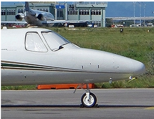
Cessna Citation S550 Cockpit HeatShields

Custom-made Heatshield Sunshades are available for almost any window in the jet. Side windows, Skylights, and Emergency Exits are all custom-made. The product is a unique composite of closed-cell foam with a silver mylar finish. The set is easily stored in the included storage sleeve. Some designs may require velcro and suction cups. Our Heatshields are offered white side out since aircraft manufacturers have issued advisories against reflective window inserts due to potential heat damage.