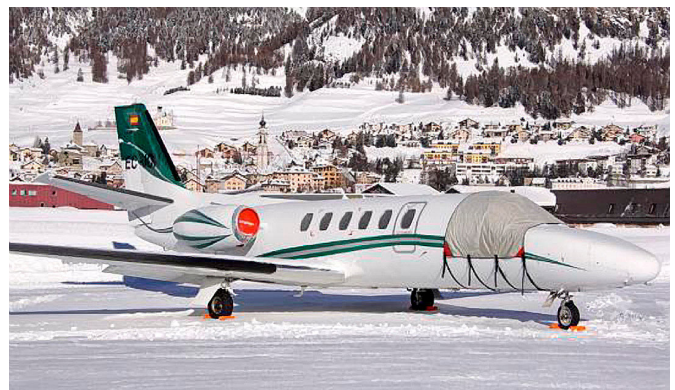
Cessna Citation 550 Windshield Cover