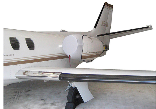
Cessna 551 Citation II SP Engine covers (with thrust reversers, smooth gen. inlet)