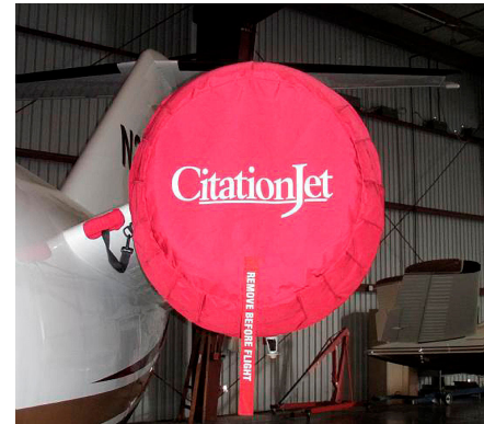
Citation Engine Cover Set