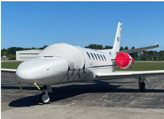
Cessna 550 Citation II

This cover type is made from Silver Acrylic Sunbrella canvas and is 100% lined with a soft and smooth microfiber. Bruce's Custom Covers developed this material combination especially for aircraft protection. The outer material is medium weight and treated for water resistance, UV resistance and anti-static buildup. The inner lining is a very soft and smooth microfiber to prevent scratching. The material is very reflective, and tests show that the cabin interior temperature can be reduced to near-ambient temperature on the hottest of days. It is water, ice and snow repellent, yet breathable to allow moisture to escape from between the cover and the aircraft surface.