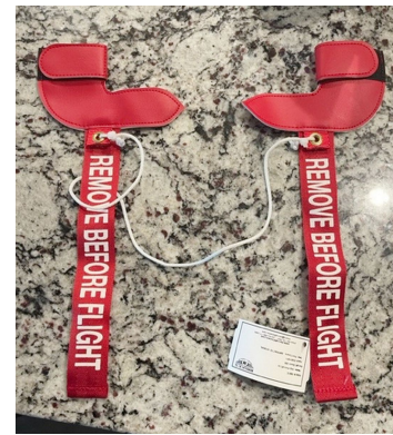
Cessna Citation Pitot Cover Set