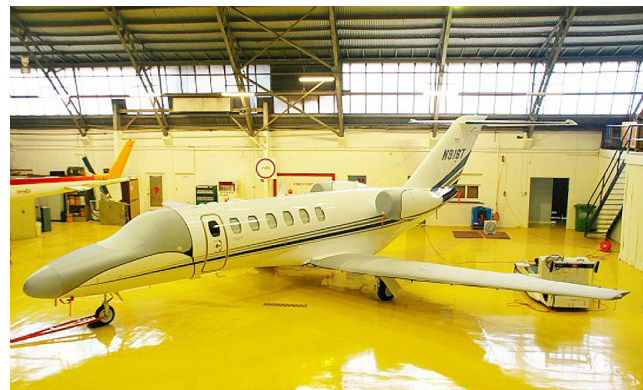
Cessna Citationjet CJ3 Cockpit/Nose, Engine &amp; Wings Travel Covers