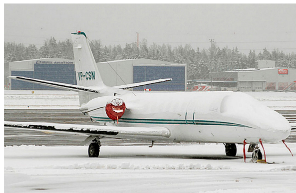
Cessna 560 Engine Inlet/Exhaust Covers, Pitot Cover Set