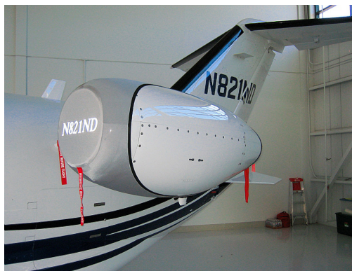
Cessna 510 Mustang Bikini Type Engine Cover

The Cessna Citation II (550, 551, UC-35A, with JT15D) Intake Covers are designed to install easily yet be completely storable. A spring steel hoop is sewn into the hem of each cover, allowing them to be installed without climbing onto the wing or using a stepladder. To store the covers the spring steel hoop folds like a band-saw blade into three nesting rings. Each cover folds into a compact circular bundle which is stored in the included duffle bag, yet they unfold quickly for use. The Tri-Fold Ring cover is made of medium weight nylon which is available in a variety of colors to match the paint trim. Each cover set comes complete with installation and folding instructions. The aircraft's registration number can be silkscreened onto the cover for an extra charge.