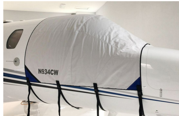
Cessna Citation M2 Cockpit Cover