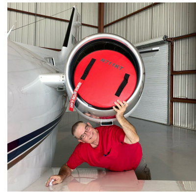
Citation II Engine Plugs