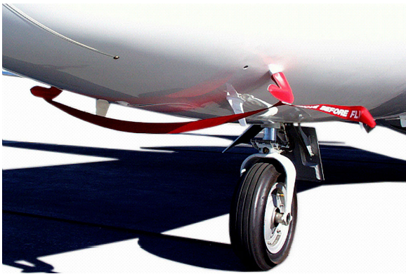
Cessna Citation I Pitot Covers

The Engine Inlet Plugs are custom fit for your Cessna Citation II (550, 551, UC-35A, with JT15D) intakes, made with heavy-duty vinyl material, and stuffed with a single block of sculpted urethane foam. Each plug has a zipper that allows the foam to be removed and dried if necessary. Engine plugs have 'remove before flight' streamers sewn onto the face of the plugs. Most plugs are imprinted with the aircraft registration number in black for an extra charge. Storage bag NOT included. Engine plugs may be inserted after flight when the engine is still warm. Engine Inlet Plugs are commonly referred to as Cowl Plugs, Intake Plugs, Cowl Blocks, Engine Blocks, and Engine Bungs.