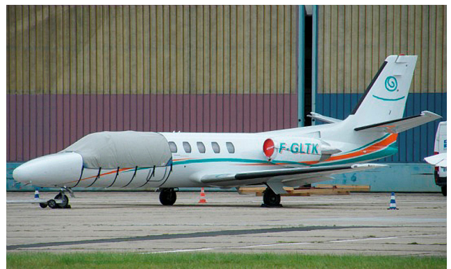
Citation Windshield Cover, to back of door