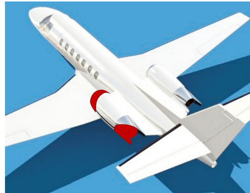
Cessna Citation II with TR's Exhaust Cover Illustration