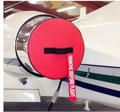
Cessna Citation S2 Exhaust Plugs