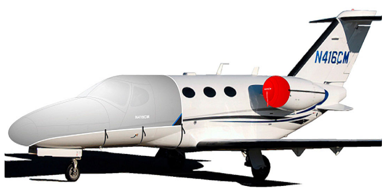
Citation Mustang Cockpit/Door/Nose Cover, Engine Inlet Cover