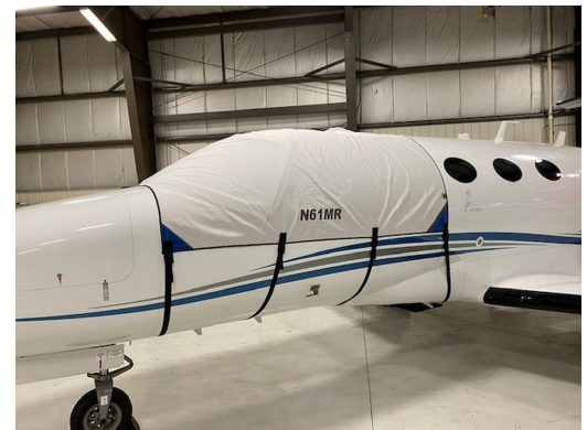
Citation Mustang Windshield Cover, Intake Cover/Exhaust Plug Set, Pitot Covers Cessna 510 Cockpit Cover extends to cover door