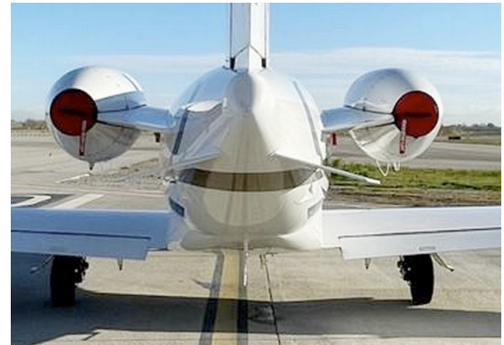
Cessna Mustang Exhaust Plugs