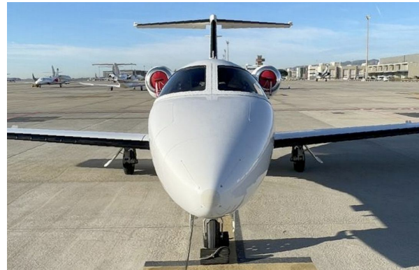
Cessna Mustang Engine Inlet Plugs