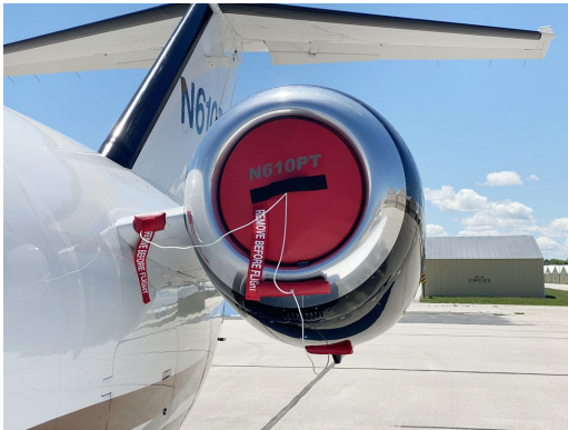
Cessna Citation Mustang 510 Engine Inlet Plugs, set of 8

The Engine Inlet Plugs are custom fit for your Cessna Mustang 510 intakes, made with heavy-duty vinyl material, and stuffed with a single block of sculpted urethane foam. Each plug has a zipper that allows the foam to be removed and dried if necessary. Engine plugs have 'remove before flight' streamers sewn onto the face of the plugs. Most plugs are imprinted with the aircraft registration number in black for an extra charge. Storage bag NOT included. Engine plugs may be inserted after flight when the engine is still warm. Engine Inlet Plugs are commonly referred to as Cowl Plugs, Intake Plugs, Cowl Blocks, Engine Blocks, and Engine Bunges.