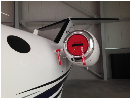
Citation Mustang Engine Intake Plugs

The Engine Inlet Plugs are custom fit for your Cessna Mustang 510 intakes, made with heavy-duty vinyl material, and stuffed with a single block of sculpted urethane foam. Each plug has a zipper that allows the foam to be removed and dried if necessary. Engine plugs have 'remove before flight' streamers sewn onto the face of the plugs. Most plugs are imprinted with the aircraft registration number in black for an extra charge. Storage bag NOT included. Engine plugs may be inserted after flight when the engine is still warm. Engine Inlet Plugs are commonly referred to as Cowl Plugs, Intake Plugs, Cowl Blocks, Engine Blocks, and Engine Bungs.