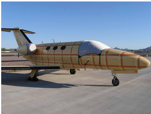
Citation Mustang Light Weight Windshield & Engine Covers

This cover type is made from Silver Acrylic Sunbrella canvas and is 100% lined with a soft and smooth microfiber. Bruce's Custom Covers developed this material combination especially for aircraft protection. The outer material is medium weight and treated for water resistance, UV resistance and anti-static buildup. The inner lining is a very soft and smooth microfiber to prevent scratching. The material is very reflective, and tests show that the cabin interior temperature can be reduced to near-ambient temperature on the hottest of days. It is water, ice and snow repellent, yet breathable to allow moisture to escape from between the cover and the aircraft surface.