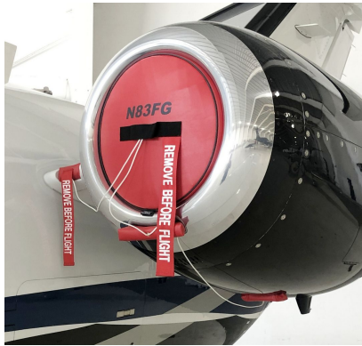
Cessna Mustang 510 Engine Inlet Plugs, Includes Intercooler Intake & Exhaust And Gen. Plugs

The Engine Inlet Plugs are custom fit for your Cessna Mustang 510 intakes, made with heavy-duty vinyl material, and stuffed with a single block of sculpted urethane foam. Each plug has a zipper that allows the foam to be removed and dried if necessary. Engine plugs have 'remove before flight' streamers sewn onto the face of the plugs. Most plugs are imprinted with the aircraft registration number in black for an extra charge. Storage bag NOT included. Engine plugs may be inserted after flight when the engine is still warm. Engine Inlet Plugs are commonly referred to as Cowl Plugs, Intake Plugs, Cowl Blocks, Engine Blocks, and Engine Bungs.