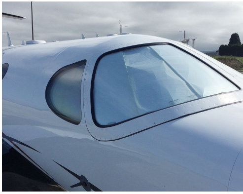
Cessna Mustang 510 Cockpit Heatshields