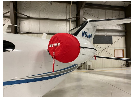
Cessna 510 Engine Inlet Covers & Exhaust Plugs