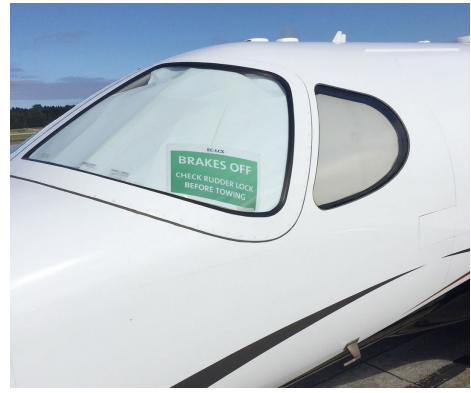
Cessna Mustang 510 Cockpit Heatshields