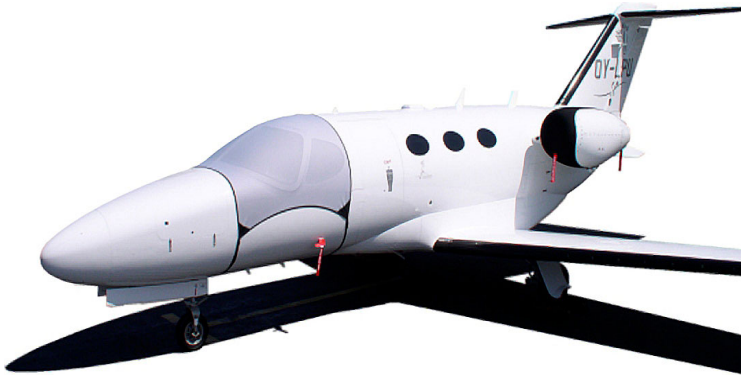
Citation Mustang Light Weight Travel Windshield Cover, "Bikini" type Engine Cover Set

Travel Covers are made with Silver Solution-Dyed Polyester fabric and only lined over the windshield to save weight. The material is lightweight and more compact for easy stowage in the aircraft. The polyester material is water resistant, but only intended for occasional use outside. We also have an ultra lightweight material available for fitted hangar dust covers. For daily outdoor use, the non-travel Sunbrella Cover is the best choice.