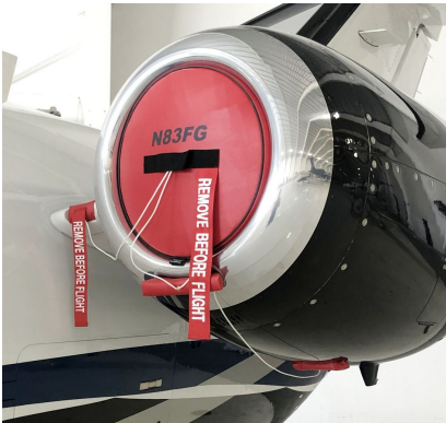
Cessna Mustang 510 Engine Inlet Plugs, Includes Intercooler Intake & Exhaust And Gen. Plugs

The Engine Inlet Plugs are custom fit for your Cessna Mustang 510 intakes, made with heavy-duty vinyl material, and stuffed with a single block of sculpted urethane foam. Each plug has a zipper that allows the foam to be removed and dried if necessary. Engine plugs have 'remove before flight' streamers sewn onto the face of the plugs. Most plugs are imprinted with the aircraft registration number in black for an extra charge. Storage bag NOT included. Engine plugs may be inserted after flight when the engine is still warm. Engine Inlet Plugs are commonly referred to as Cowl Plugs, Intake Plugs, Cowl Blocks, Engine Blocks, and Engine Bungs.