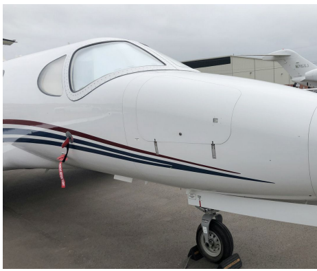
Cessna Mustang 510 Cockpit Heatshields, Pitot Cover/AOA