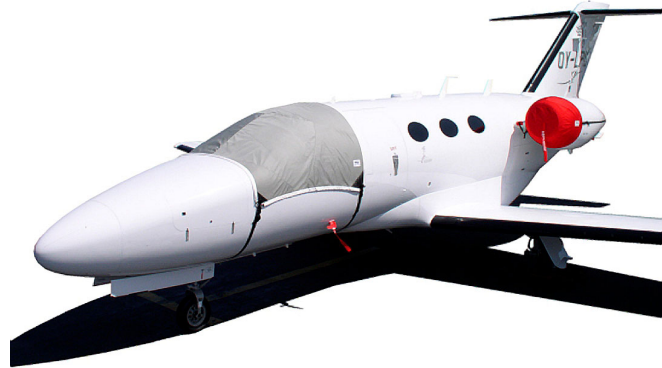
Cessna 510 Cockpit Cover extends to cover door Citation Mustang Windshield Cover, Intake Cover/Exhaust Plug Set, Pitot Covers