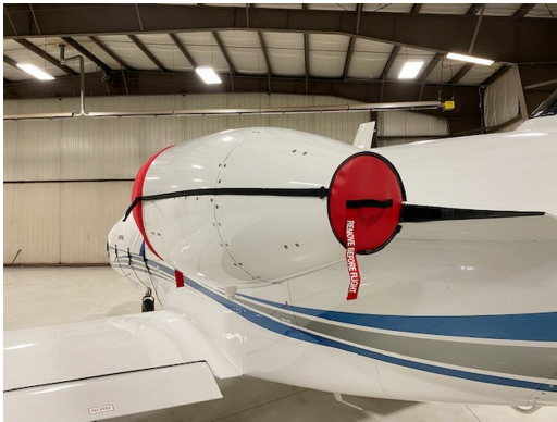
Cessna 510 Engine Inlet Covers & Exhaust Plugs

The Cessna Mustang 510 Intake/Exhaust Plugs are custom fit for the intake and exhaust openings, made with heavy-duty vinyl material, and stuffed with a single block of sculpted urethane foam. Each plug has a zipper that allows the foam to be removed and dried if necessary. Engine plugs have 'remove before flight' streamers sewn onto the face of the plugs. Most plugs are imprinted with the aircraft registration number in black. Engine plugs may be inserted after flight when the engine is still warm. Engine Inlet Plugs are commonly referred to as Cowl Plugs, Intake Plugs, Cowl Blocks, Engine Blocks, and Engine Bungs.