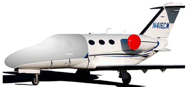
Citation Mustang Cockpit/Door/Nose Cover, Engine Inlet Cover