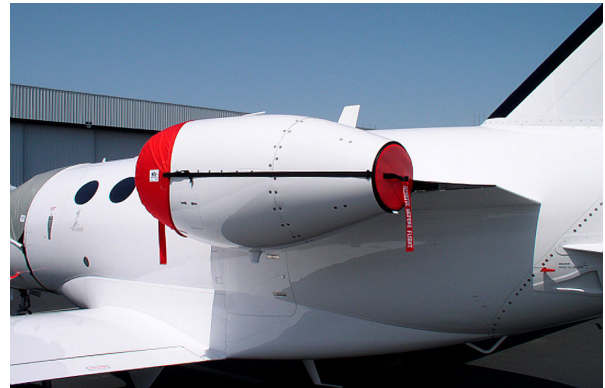
Citation Mustang Intake Cover/Exhaust Plug Set