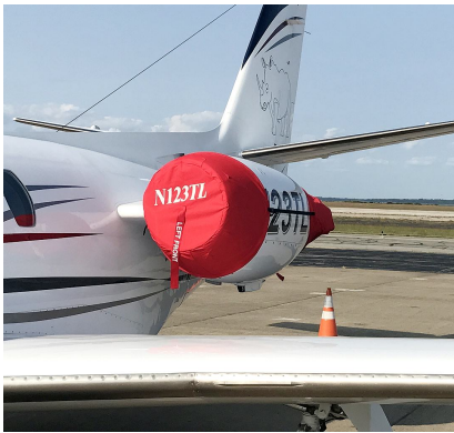
Cessna Citation S/II (S550) Engine Covers (With Tr's)

The Cessna Citation I (500/501) Intake Covers are designed to install easily yet be completely storable. A spring steel hoop is sewn into the hem of each cover, allowing them to be installed without climbing onto the wing or using a stepladder. To store the covers the spring steel hoop folds like a band-saw blade into three nesting rings. Each cover folds into a compact circular bundle which is stored in the included duffel bag, yet they unfold quickly for use. The Tri-Fold Ring cover is made of medium weight nylon which is available in a variety of colors to match the paint trim. Each cover set comes complete with installation and folding instructions. The aircraft's registration number can be silkscreened onto the cover for an extra charge.