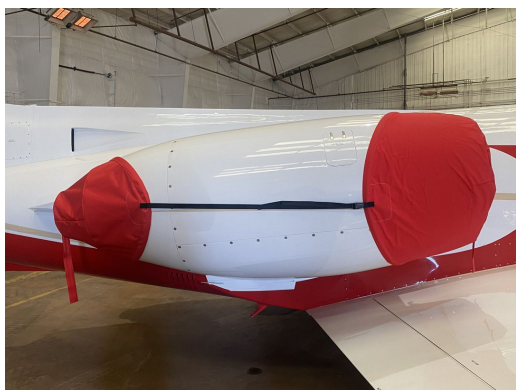
Cessna 501 Engine Covers NO TR's

The Cessna Citation I (500/501) Intake Covers are designed to install easily yet be completely storable. A spring steel hoop is sewn into the hem of each cover, allowing them to be installed without climbing onto the wing or using a stepladder. To store the covers the spring steel hoop folds like a band-saw blade into three nesting rings. Each cover folds into a compact circular bundle which is stored in the included duffle bag, yet they unfold quickly for use. The Tri-Fold Ring cover is made of medium weight nylon which is available in a variety of colors to match the paint trim. Each cover set comes complete with installation and folding instructions. The aircraft's registration number can be silkscreened onto the cover for an extra charge.