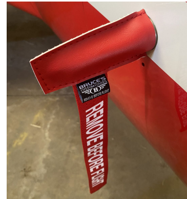
Cessna 501 Angle of Attack Transducer Cover