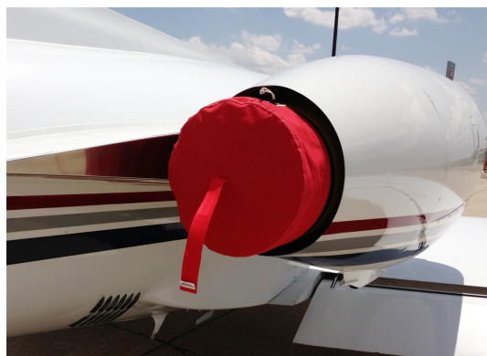
Cessna Citation Stallion Exhaust Cover