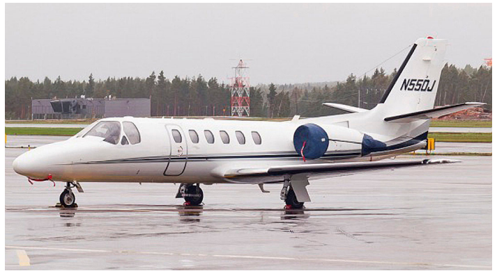
Cessna Citation Bravo Engine Covers and Pitot Covers sets