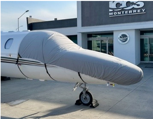
Cessna Citation Windshield Cover, Engine Cover set and Pitot Covers Cessna Citationjet 525B Travel Weight Cockpit/Nose Cover