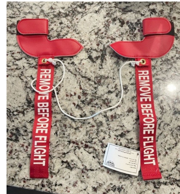
Cessna Citation Pitot Cover Set