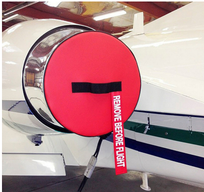
Cessna Citation S2 Exhaust Plugs

The Engine Inlet Plugs are custom fit for your Cessna Citation I (500/501) intakes, made with heavy-duty vinyl material, and stuffed with a single block of sculpted urethane foam. Each plug has a zipper that allows the foam to be removed and dried if necessary. Engine plugs have 'remove before flight' streamers sewn onto the face of the plugs. Most plugs are imprinted with the aircraft registration number in black for an extra charge. Storage bag NOT included. Engine plugs may be inserted after flight when the engine is still warm. Engine Inlet Plugs are commonly referred to as Cowl Plugs, Intake Plugs, Cowl Blocks, Engine Blocks, and Engine Bungs.