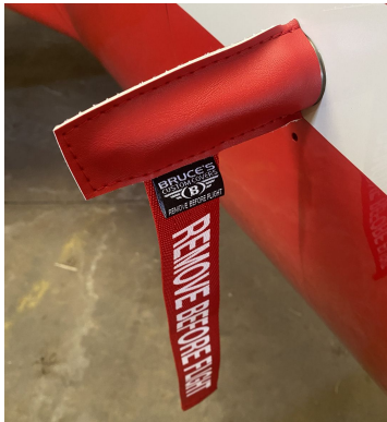
Cessna 501 Angle of Attack Transducer Cover

The Engine Inlet Plugs are custom fit for your Cessna Citation I (500/501) intakes, made with heavy-duty vinyl material, and stuffed with a single block of sculpted urethane foam. Each plug has a zipper that allows the foam to be removed and dried if necessary. Engine plugs have 'remove before flight' streamers sewn onto the face of the plugs. Most plugs are imprinted with the aircraft registration number in black for an extra charge. Storage bag NOT included. Engine plugs may be inserted after flight when the engine is still warm. Engine Inlet Plugs are commonly referred to as Cowl Plugs, Intake Plugs, Cowl Blocks, Engine Blocks, and Engine Bungs.