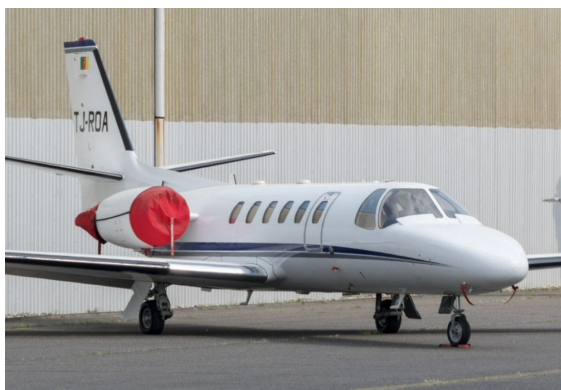
Cessna Citation II Bravo Engine Covers

The Cessna Citation I (500/501) Intake Covers are designed to install easily yet be completely storable. A spring steel hoop is sewn into the hem of each cover, allowing them to be installed without climbing onto the wing or using a stepladder. To store the covers the spring steel hoop folds like a band-saw blade into three nesting rings. Each cover folds into a compact circular bundle which is stored in the included duffel bag, yet they unfold quickly for use. The Tri-Fold Ring cover is made of medium weight nylon which is available in a variety of colors to match the paint trim. Each cover set comes complete with installation and folding instructions. The aircraft's registration number can be silkscreened onto the cover for an extra charge.