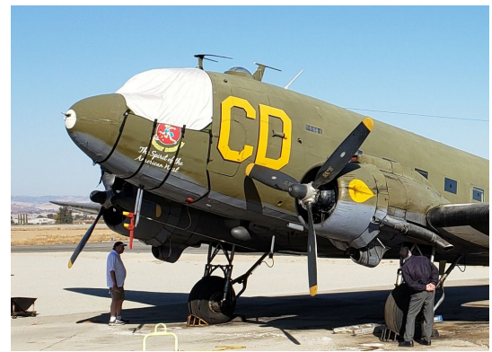
Douglas DC-3 Cockpit Cover