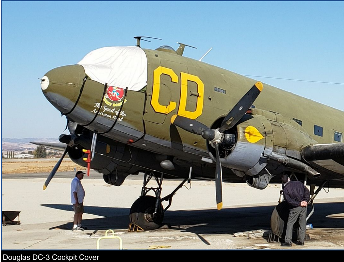
Douglas DC-3 Cockpit Cover