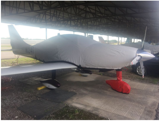
Lancair Columbia Extended Canopy/Engine Cover, Nose Wheelpant Cover

protection and cover longevity. This heavier more durable material is intended for all weather conditions, such as rain and snow or lots of sun.