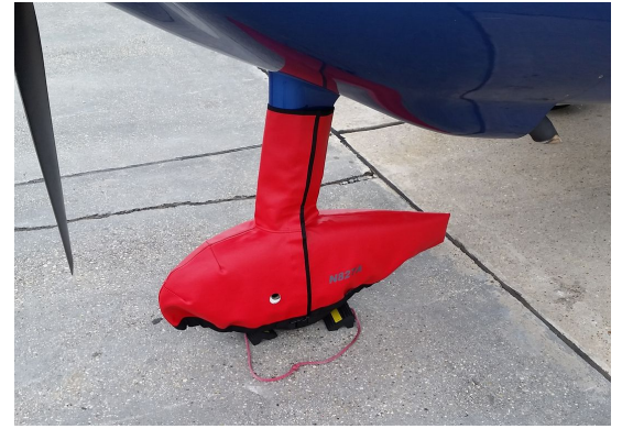
Lancair Columbia Nose Wheelpant/Strut Cover