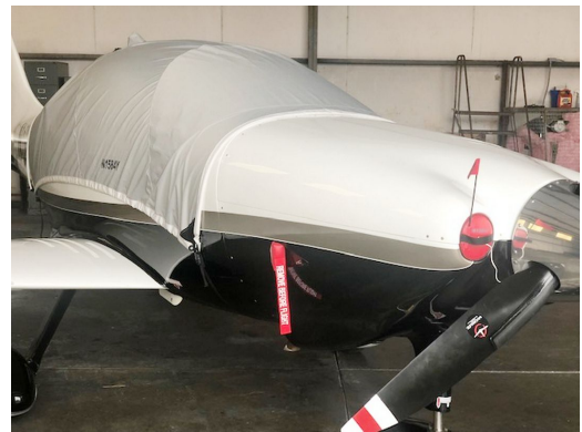
Columbia 350 Travel Cover, Engine Plugs