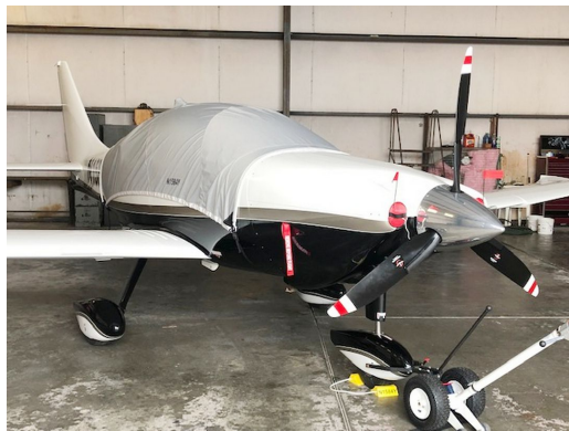
Columbia 350 Travel Cover, Engine Plugs

Travel Covers are made with Silver Solution-Dyed Polyester fabric and only lined over the windshield to save weight. The material is lightweight and more compact for easy stowage in the aircraft. The polyester material is water resistant, but only intended for occasional use outside. We also have an ultra lightweight material available for fitted hangar dust covers. For daily outdoor use, the non-travel Sunbrella Cover is the best choice.