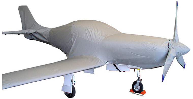
Lancair 320 Complete Fuselage/Wing Cover & Prop Cover