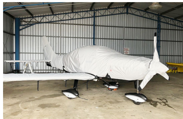
Columbia 350 Full Cover Set