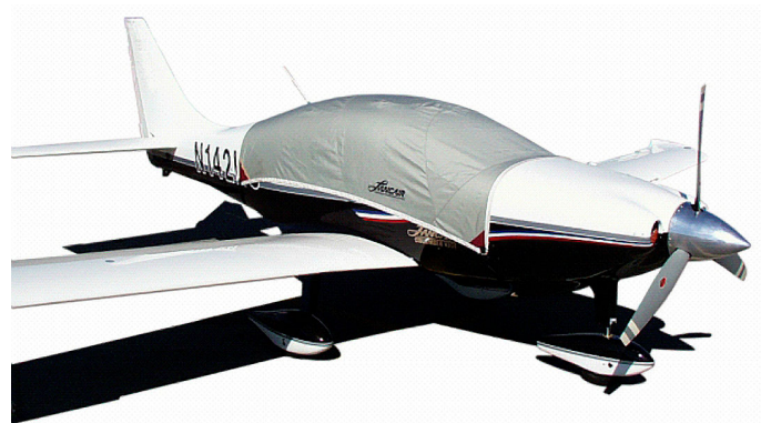
Cessna 350/400 Canopy Cover