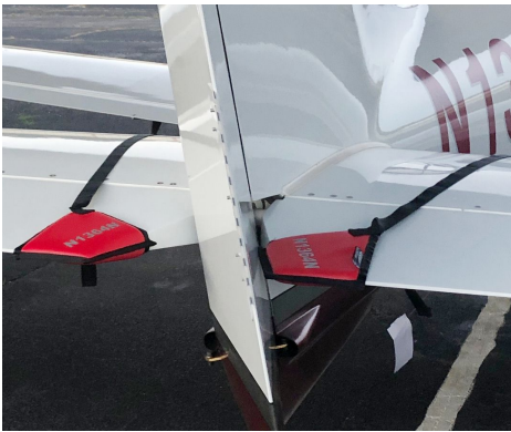
Lancair Columbia Rudder Gust Pad

Engine Inlet Plugs are custom fit for your Cessna Corvalis, Corvalis TT, Models T240, 350 & 400 intakes, made with heavy-duty vinyl material, and stuffed with a single block of sculpted urethane foam. Each plug has a zipper that allows the foam to be removed and dried if necessary. Engine plugs have warning flags that are visible from the cockpit or 'remove before flight' streamers sewn onto the face of the plugs. Most plugs are imprinted with the aircraft registration number in black for an extra charge. Storage bag NOT included. Engine plugs may be inserted after flight when the engine is still warm. Engine Inlet Plugs are commonly referred to as Cowl Plugs, Intake Plugs, Cowl Blocks, Engine Blocks, and Engine Bung s. Designed to prevent damage to the aircraft extremities in crowded hangars, these products are made of bright red Naugahyde and thickly padded with a sandwich of closed cell foam.