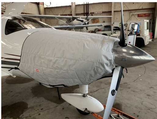
Cessna Corvalis Insulated Engine Cover

This cover type is made from Silver Acrylic Sunbrella canvas and is 100% lined with a soft and smooth microfiber. Bruce's Custom Covers developed this material combination especially for aircraft protection. The outer material is medium weight and treated for water resistance, UV resistance and anti-static buildup. The inner lining is a very soft and smooth microfiber to prevent scratching. The material is very reflective, and tests show that the cabin interior temperature can be reduced to near-ambient temperature on the hottest of days. It is water, ice and snow repellent, yet breathable to allow moisture to escape from between the cover and the aircraft surface.