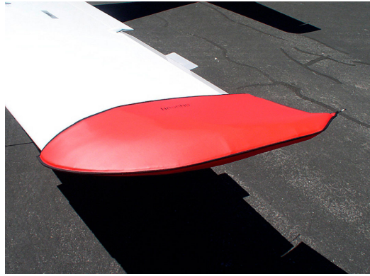
Cessna 350/400 Wingtip Pads

Designed to prevent damage to the aircraft extremities in crowded hangars, these products are made of bright red Naugahyde and thickly padded with a sandwich of closed cell foam.