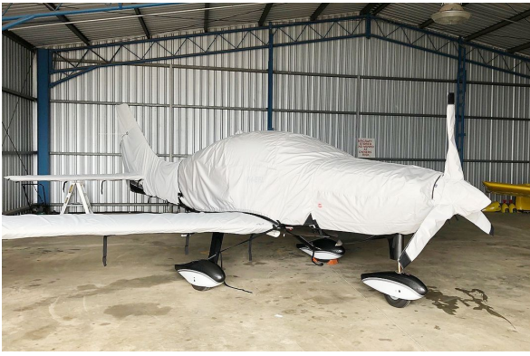
Columbia 350 Full Cover Set