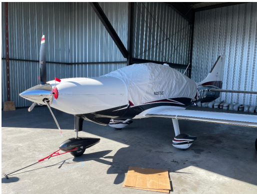
Textron T240 Canopy Cover

This cover type is made from Silver Acrylic Sunbrella canvas and is 100% lined with a soft and smooth microfiber. Bruce's Custom Covers developed this material combination especially for aircraft protection. The outer material is medium weight and treated for water resistance, UV resistance and anti-static buildup. The inner lining is a very soft and smooth microfiber to prevent scratching. The material is very reflective, and tests show that the cabin interior temperature can be reduced to near-ambient temperature on the hottest of days. It is water, ice and snow repellent, yet breathable to allow moisture to escape from between the cover and the aircraft surface.