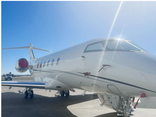
Canadair Challenger 300 Cockpit HeatShields, Intake Plugs