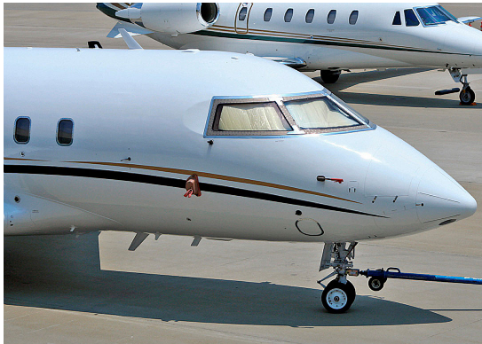
Challenger 604 Cockpit HeatShields