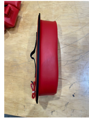
Canadair Challenger 300, 350 APU Exhaust Plug