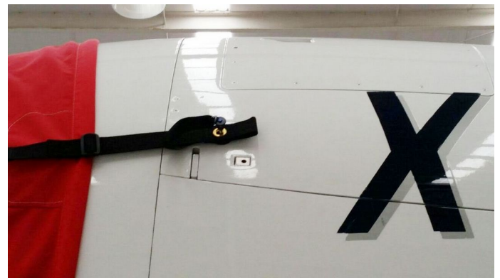
Canadair Challenger 300 Intake/Exhaust Covers, 3-Strap Type