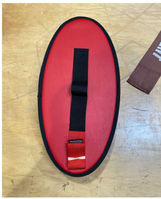
Canadair Challenger 300, 350 APU Exhaust Plug