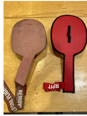
Canadair Challenger 300, 350 Heat Exchanger Exhaust Plug