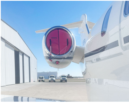
Canadair Challenger 300 Intake Plugs