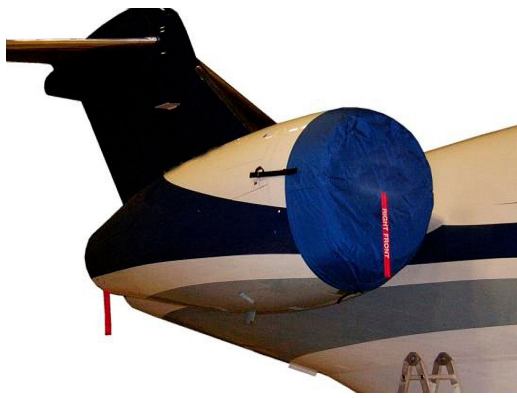
Challenger 300 Intake Covers (set of 2), come in colors