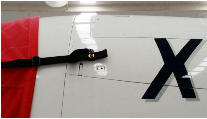
Challenger 300 Intake Covers