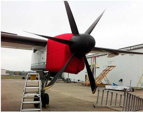
Dash 8-Q400 Insulated Engine Cover