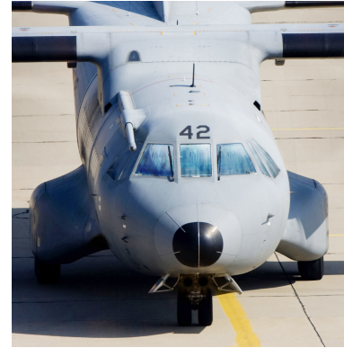
Casa C-295 Cockpit HeatShields (illustration)