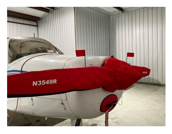
Beech A23 Musketeer Insulated Prop Cover, Engine Plugs

plugs have warning flags that are visible from the cockpit or 'remove before flight' streamers sewn onto the face of the plugs. Most plugs are imprinted with the aircraft registration number in black for an extra charge. Storage bag NOT included. Engine plugs may be inserted after flight when the engine is still warm. Engine Inlet Plugs are commonly referred to as Cowl Plugs, Intake Plugs, Cowl Blocks, Engine Blocks, and Engine Bungs.