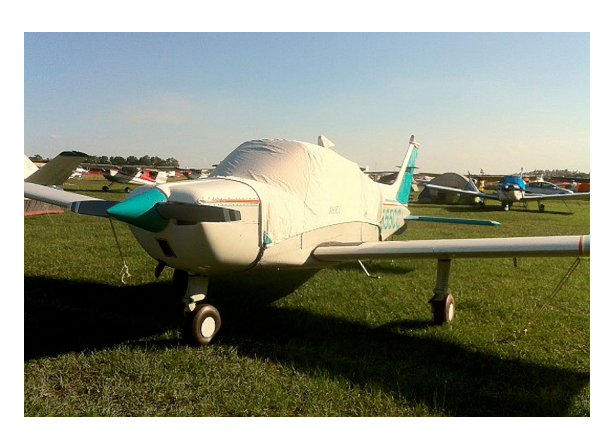
Beech C23 Sundowner Canopy Cover