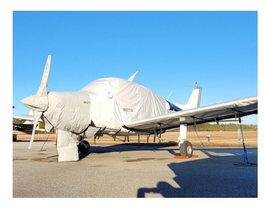
Beech Sundowner Winter Cover Set

WINTER USE MATERIAL - Made with Solution-Dyed Polyester fabric, this option is intended for seasonal use to aid in deicing, rain mitigation, or for occasional travel. The material is lighter and more compact, but more susceptible to UV damage and may have a shorter useful life if used continuously outside than the all-year use material.