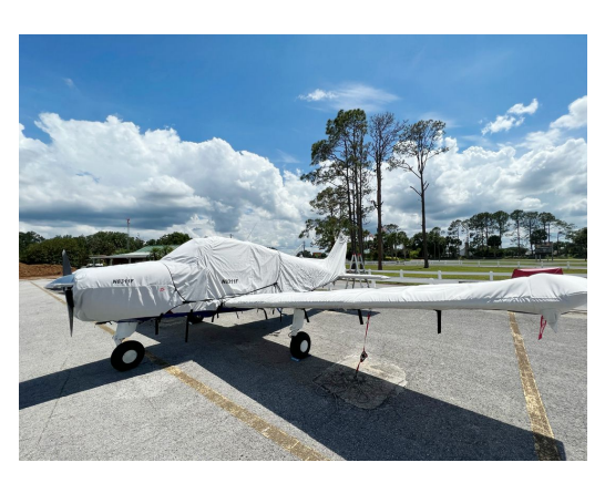
Beech Musketeer A23 Cover Set