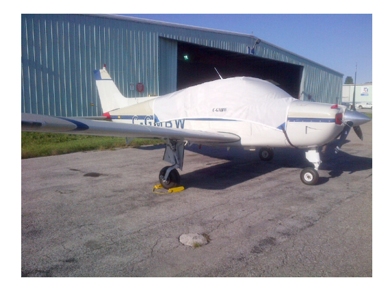
Beech Sierra Canopy Cover, Engine Plugs, Tailcone Cover