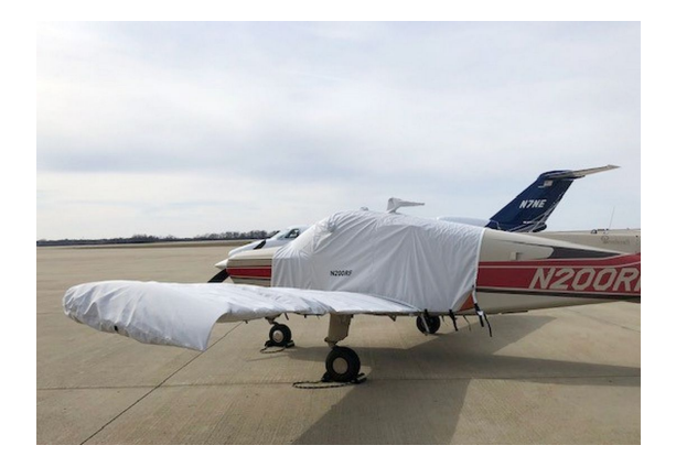
Beech C23 Extended Canopy Cover, Wing Covers

This cover type is made from Silver Acrylic Sunbrella canvas and is 100% lined with a soft and smooth microfiber. Bruce's Custom Covers developed this material combination especially for aircraft protection. The outer material is medium weight and treated for water resistance, UV resistance and anti-static buildup. The inner lining is a very soft and smooth microfiber to prevent scratching. The material is very reflective, and tests show that the cabin interior temperature can be reduced to near-ambient temperature on the hottest of days. It is water, ice and snow repellent, yet breathable to allow moisture to escape from between the cover and the aircraft surface.