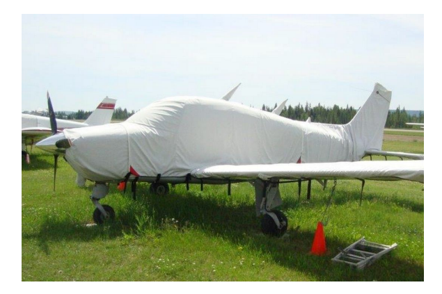
Beech Sierra Engine, Extended Canopy, Empennage, & Wing Covers