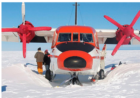
Casa 212 Insulated Engine &amp; Propellor/Spinner Covers

Engine Inlet Plugs are custom fit for your Casa 212 Aviocar intakes, made with heavy-duty vinyl material, and stuffed with a single block of sculpted urethane foam. Each plug has a zipper that allows the foam to be removed and dried if necessary. Engine plugs have warning flags that are visible from the cockpit or 'remove before flight' streamers sewn onto the face of the plugs. Most plugs are imprinted with the aircraft registration number in black for an extra charge. Storage bag NOT included. Engine plugs may be inserted after flight when the engine is still warm. Engine Inlet Plugs are commonly referred to as Cowl Plugs, Intake Plugs, Cowl Blocks, Engine Blocks, and Engine Bungs.