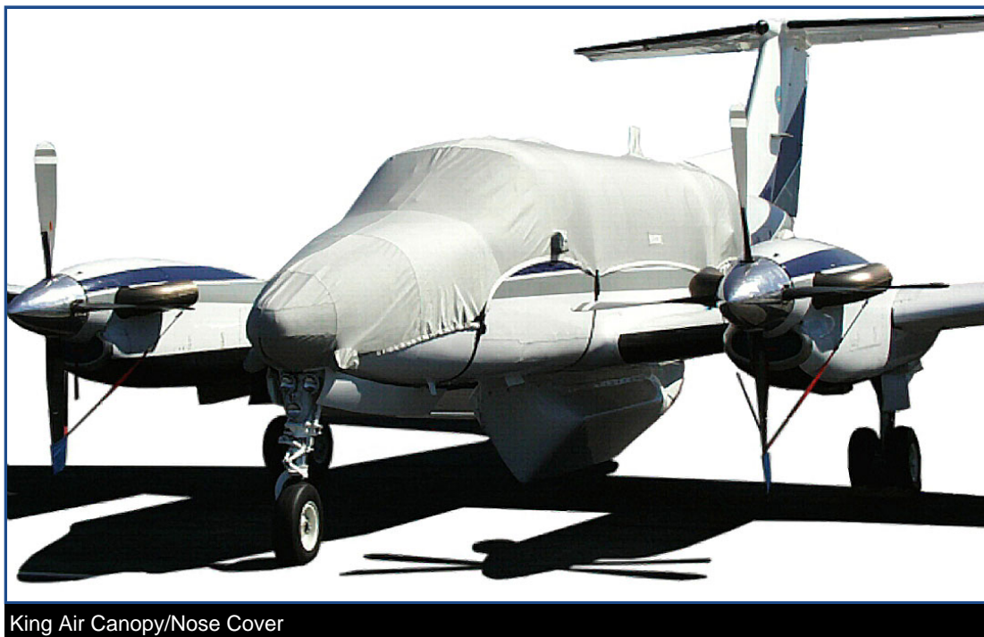
King Air Canopy/Nose Cover