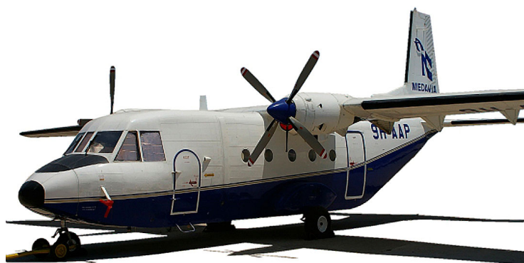
Casa 212 Engine Plugs