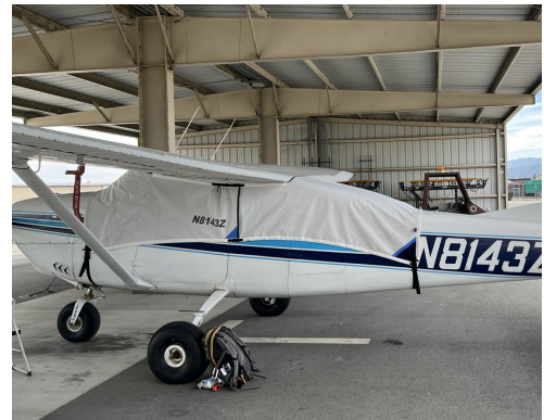
Cessna 205 Canopy cover, wrap-around