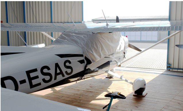
Cessna 206 Stationair Canopy Cover, Wrap-Around

This cover type is made from Silver Acrylic Sunbrella canvas and is 100% lined with a soft and smooth microfiber. Bruce's Custom Covers developed this material combination especially for aircraft protection. The outer material is medium weight and treated for water resistance, UV resistance and anti-static buildup. The inner lining is a very soft and smooth microfiber to prevent scratching. The material is very reflective, and tests show that the cabin interior temperature can be reduced to near-ambient temperature on the hottest of days. It is water, ice and snow repellent, yet breathable to allow moisture to escape from between the cover and the aircraft surface.