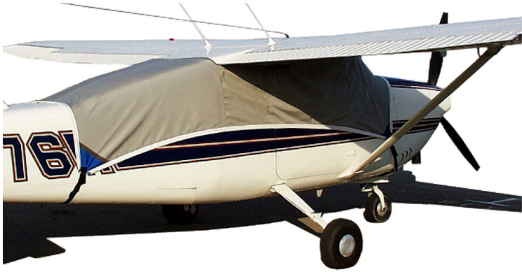
Cessna 206 Wrap-Around Canopy Cover