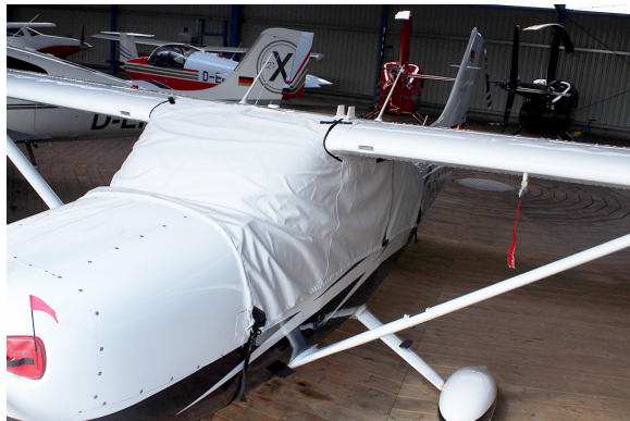
Cessna 206 Stationair Canopy Cover, Wrap-Around

This cover type is made from Silver Acrylic Sunbrella canvas and is 100% lined with a soft and smooth microfiber. Bruce's Custom Covers developed this material combination especially for aircraft protection. The outer material is medium weight and treated for water resistance, UV resistance and anti-static buildup. The inner lining is a very soft and smooth microfiber to prevent scratching. The material is very reflective, and tests show that the cabin interior temperature can be reduced to near-ambient temperature on the hottest of days. It is water, ice and snow repellent, yet breathable to allow moisture to escape from between the cover and the aircraft surface.