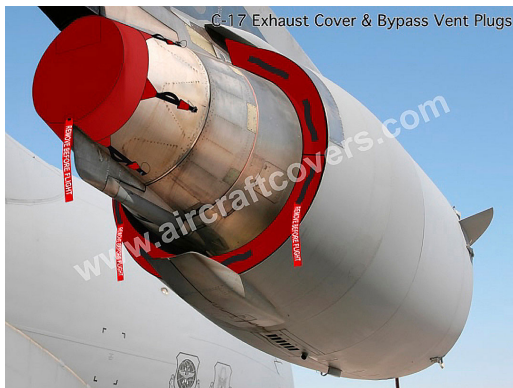
C-17 Globemaster Exhaust Cover and Bypass Vent Plugs, folding type

The Engine Inlet Plugs are custom fit for your McDonnell Douglas Globemaster C-17 intakes, made with heavy-duty vinyl material, and stuffed with a single block of sculpted urethane foam. Each plug has a zipper that allows the foam to be removed and dried if necessary. Engine plugs have 'remove before flight' streamers sewn onto the face of the plugs. Most plugs are imprinted with the aircraft registration number in black for an extra charge. Storage bag NOT included. Engine plugs may be inserted after flight when the engine is still warm. Engine Inlet Plugs are commonly referred to as Cowl Plugs, Intake Plugs, Cowl Blocks, Engine Blocks, and Engine Bunges.