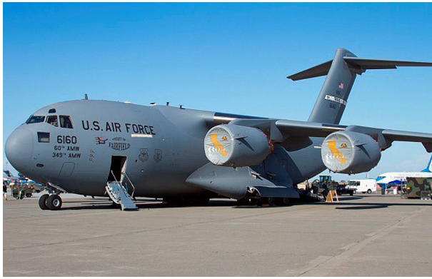
C-17 Engine Intake Covers and Exhaust Covers