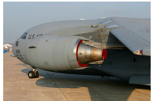
C-17 Bypass and Exhaust Plugs (illustration)