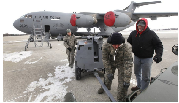
McDonnell Douglas C-17 Intake Covers