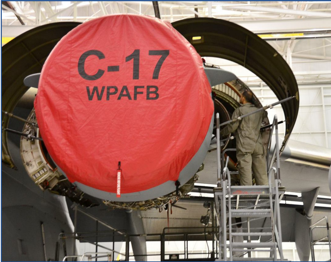
McDonnell Douglas C-17 Intake Cover