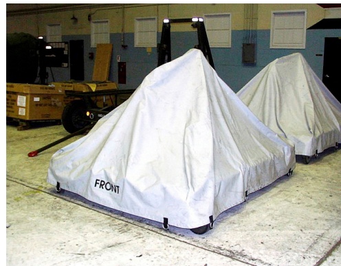
C-130 Prop Stand Covers