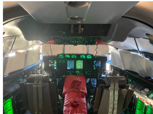
Lockheed C-130 Hercules Flight Deck Heatshield Set