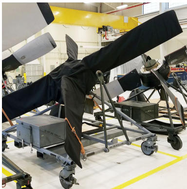
C-130 QEC / Maintenance Cover Set

This cover type is made from Silver Acrylic Sunbrella canvas and is 100% lined with a soft and smooth microfiber. Bruce's Custom Covers developed this material combination especially for aircraft protection. The outer material is medium weight and treated for water resistance, UV resistance and anti-static buildup. The inner lining is a very soft and smooth microfiber to prevent scratching. The material is very reflective, and tests show that the cabin interior temperature can be reduced to near-ambient temperature on the hottest of days. It is water, ice and snow repellent, yet breathable to allow moisture to escape from between the cover and the aircraft surface.