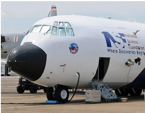
Lockheed C-130 Flight Deck HeatShield Set

Windshield and Skylight Heatshields are interior sunshades for an aircraft's front windshield and overhead window. The product is a unique composite of closed-cell foam with a silver mylar finish. The semi-rigid design is stiff enough to stand along the inside of the windshield using sun visors or window framing. It folds up flat and easily stores in the included storage sleeve. Some designs may require velcro and suction cups or split right and left sides. A Heatshield is an excellent short-term remedy for cockpit overheating. An external fabric cover is far more effective and practical for long-term protection.