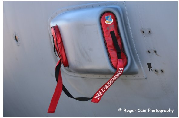
Lockheed C-130 Flight Deck Inlet/Exhaust Plugs