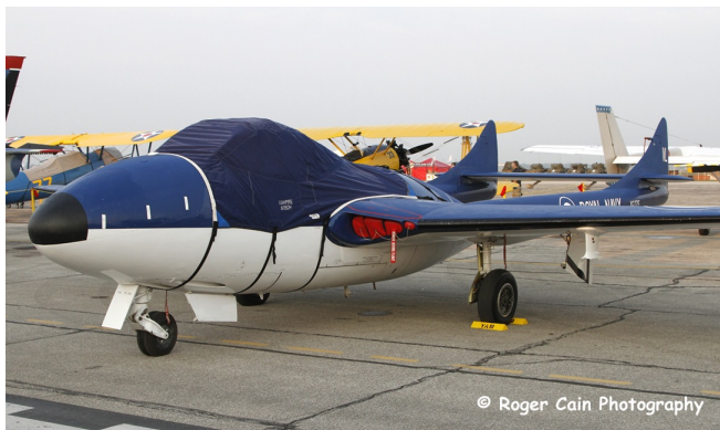
DeHavilland Vampire Canopy Cover, Engine Plugs

This cover type is made from Silver Acrylic Sunbrella canvas and is 100% lined with a soft and smooth microfiber. Bruce's Custom Covers developed this material combination especially for aircraft protection. The outer material is medium weight and treated for water resistance, UV resistance and anti-static buildup. The inner lining is a very soft and smooth microfiber to prevent scratching. The material is very reflective, and tests show that the cabin interior temperature can be reduced to near-ambient temperature on the hottest of days. It is water, ice and snow repellent, yet breathable to allow moisture to escape from between the cover and the aircraft surface.