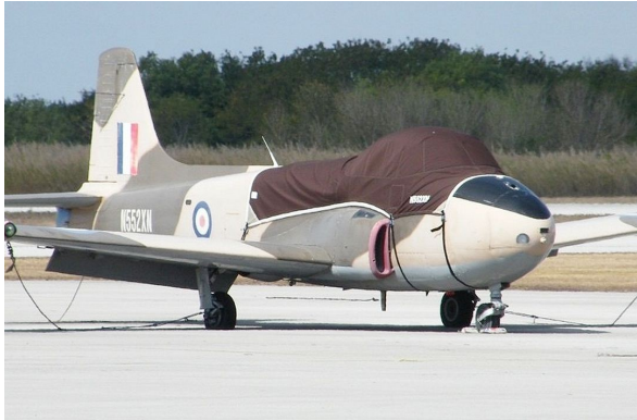
Jet Provost Canopy Cover

Travel Covers are made with Silver Solution-Dyed Polyester fabric and only lined over the windshield to save weight. The material is lightweight and more compact for easy stowage in the aircraft. The polyester material is water resistant, but only intended for occasional use outside. We also have an ultra lightweight material available for fitted hangar dust covers. For daily outdoor use, the non-travel Sunbrella Cover is the best choice.