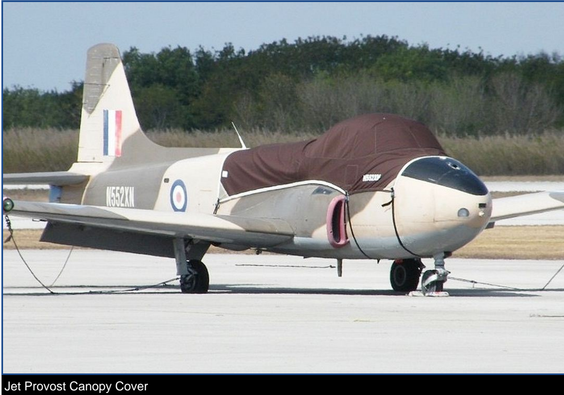
Jet Provost Canopy Cover