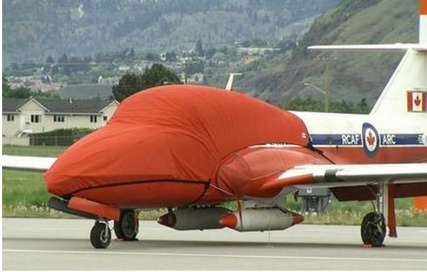
Canadair CT-114 Canopy/Nose Cover

This cover type is made from Silver Acrylic Sunbrella canvas and is 100% lined with a soft and smooth microfiber. Bruce's Custom Covers developed this material combination especially for aircraft protection. The outer material is medium weight and treated for water resistance, UV resistance and anti-static buildup. The inner lining is a very soft and smooth microfiber to prevent scratching. The material is very reflective, and tests show that the cabin interior temperature can be reduced to near-ambient temperature on the hottest of days. It is water, ice and snow repellent, yet breathable to allow moisture to escape from between the cover and the aircraft surface.