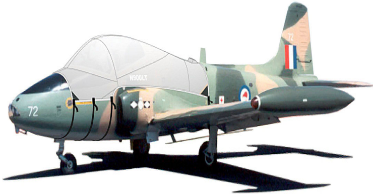
Jet Provost Canopy Cover (Illustration)

Travel Covers are made with Silver Solution-Dyed Polyester fabric and only lined over the windshield to save weight. The material is lightweight and more compact for easy stowage in the aircraft. The polyester material is water resistant, but only intended for occasional use outside. We also have an ultra lightweight material available for fitted hangar dust covers. For daily outdoor use, the non-travel Sunbrella Cover is the best choice.