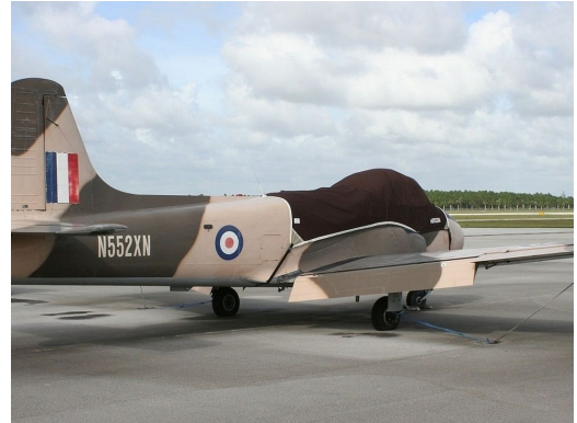
Jet Provost Canopy Cover