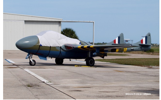
DeHavilland Vampire Canopy Cover