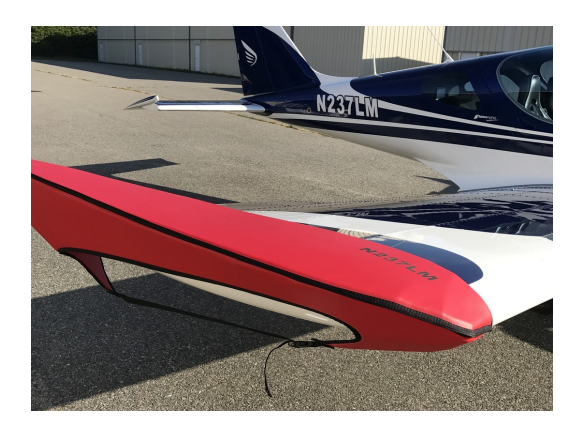
BRM Aero Bristell S-LSA Wingtip Pads