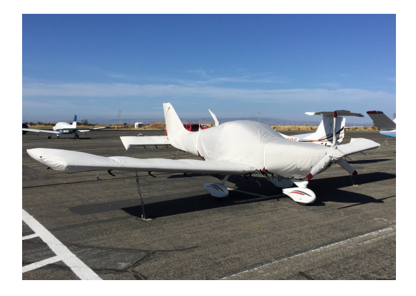
BRM Bristell S-LSA Full Cover Set

This cover type is made from Silver Acrylic Sunbrella canvas and is 100% lined with a soft and smooth microfiber. Bruce's Custom Covers developed this material combination especially for aircraft protection. The outer material is medium weight and treated for water resistance, UV resistance and anti-static buildup. The inner lining is a very soft and smooth microfiber to prevent scratching. The material is very reflective, and tests show that the cabin interior temperature can be reduced to near-ambient temperature on the hottest of days. It is water, ice and snow repellent, yet breathable to allow moisture to escape from between the cover and the aircraft surface.