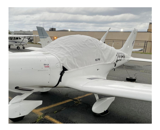
Bristell LSA Canopy Cover

This cover type is made from Silver Acrylic Sunbrella canvas and is 100% lined with a soft and smooth microfiber. Bruce's Custom Covers developed this material combination especially for aircraft protection. The outer material is medium weight and treated for water resistance, UV resistance and anti-static buildup. The inner lining is a very soft and smooth microfiber to prevent scratching. The material is very reflective, and tests show that the cabin interior temperature can be reduced to near-ambient temperature on the hottest of days. It is water, ice and snow repellent, yet breathable to allow moisture to escape from between the cover and the aircraft surface.