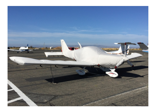
BRM Bristell S-LSA Full Cover Set

Designed to prevent damage to the aircraft extremities in crowded hangars, these products are made of bright red Naugahyde and thickly padded with a sandwich of closed cell foam.