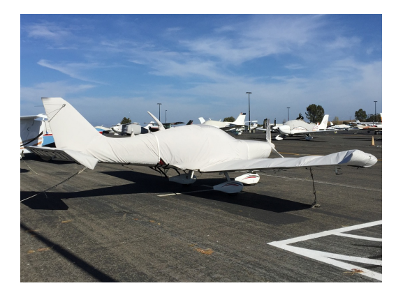
BRM Bristell S-LSA Full Cover Set