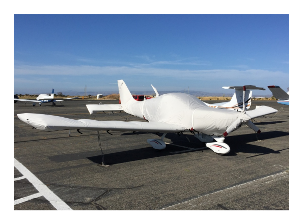
BRM Bristell S-LSA Full Cover Set

WINTER USE MATERIAL - Made with Solution-Dyed Polyester fabric, this option is intended for seasonal use to aid in deicing, rain mitigation, or for occasional travel. The material is lighter and more compact, but more susceptible to UV damage and may have a shorter useful life if used continuously outside than the all-year use material.