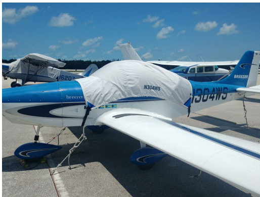
Ikarus Breezer Canopy Cover

This cover type is made from Silver Acrylic Sunbrella canvas and is 100% lined with a soft and smooth microfiber. Bruce's Custom Covers developed this material combination especially for aircraft protection. The outer material is medium weight and treated for water resistance, UV resistance and anti-static buildup. The inner lining is a very soft and smooth microfiber to prevent scratching. The material is very reflective, and tests show that the cabin interior temperature can be reduced to near-ambient temperature on the hottest of days. It is water, ice and snow repellent, yet breathable to allow moisture to escape from between the cover and the aircraft surface.