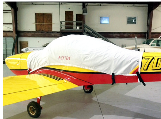
Ikarus Breezer Canopy Cover