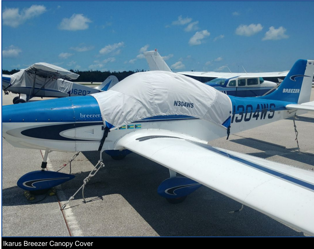
Ikarus Breezer Canopy Cover