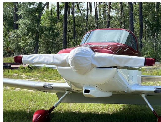
Mustang 2 Prop/Spinner Cover