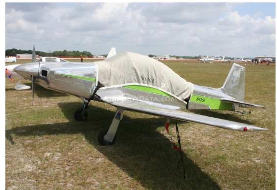
Bushby Mustang Canopy Cover