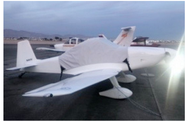
Thorp T-18 Canopy Cover