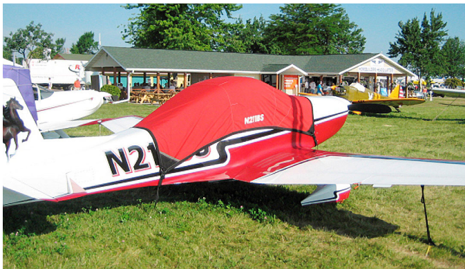
Bushby Mustang Canopy Cover

Travel Covers are made with Silver Solution-Dyed Polyester fabric and only lined over the windshield to save weight. The material is lightweight and more compact for easy stowage in the aircraft. The polyester material is water resistant, but only intended for occasional use outside. We also have an ultra lightweight material available for fitted hangar dust covers. For daily outdoor use, the non-travel Sunbrella Cover is the best choice.