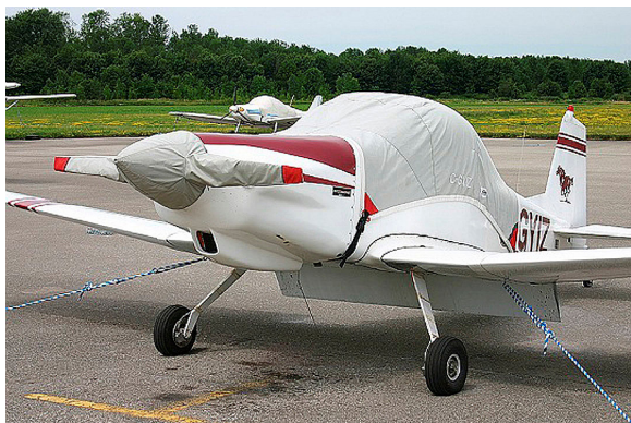
Bushby Mustang Canopy cover and Propellor/Spinner cover

This cover type is made from Silver Acrylic Sunbrella canvas and is 100% lined with a soft and smooth microfiber. Bruce's Custom Covers developed this material combination especially for aircraft protection. The outer material is medium weight and treated for water resistance, UV resistance and anti-static buildup. The inner lining is a very soft and smooth microfiber to prevent scratching. The material is very reflective, and tests show that the cabin interior temperature can be reduced to near-ambient temperature on the hottest of days. It is water, ice and snow repellent, yet breathable to allow moisture to escape from between the cover and the aircraft surface.