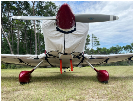
Bushby Mustang Complete Fuselage Cover with Detachable Wing Covers

This cover type is made from Silver Acrylic Sunbrella canvas and is 100% lined with a soft and smooth microfiber. Bruce's Custom Covers developed this material combination especially for aircraft protection. The outer material is medium weight and treated for water resistance, UV resistance and anti-static buildup. The inner lining is a very soft and smooth microfiber to prevent scratching. The material is very reflective, and tests show that the cabin interior temperature can be reduced to near-ambient temperature on the hottest of days. It is water, ice and snow repellent, yet breathable to allow moisture to escape from between the cover and the aircraft surface.