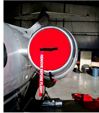
Beechjet 400A Engine Intake Plug with Generator Inlet Plug