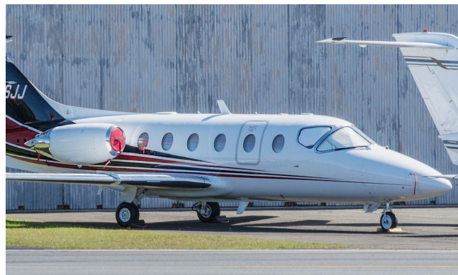
Beechjet Engine Plugs and Cockpit Heatshields