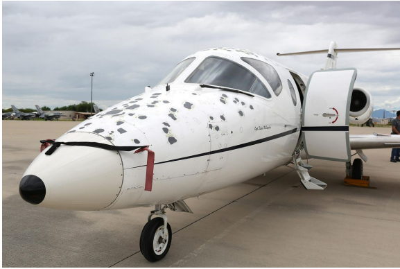
Raytheon Beechjet Hail Damage, and Pitot Covers

The Engine Inlet Plugs are custom fit for your Hawker Beechcraft Beechjet 400, Hawker 400XP (T1A, T400 Jayhawk) intakes, made with heavy-duty vinyl material, and stuffed with a single block of sculpted urethane foam. Each plug has a zipper that allows the foam to be removed and dried if necessary. Engine plugs have 'remove before flight' streamers sewn onto the face of the plugs. Most plugs are imprinted with the aircraft registration number in black for an extra charge. Storage bag NOT included. Engine plugs may be inserted after flight when the engine is still warm. Engine Inlet Plugs are commonly referred to as Cowl Plugs, Intake Plugs, Cowl Blocks, Engine Blocks, and Engine Bung.