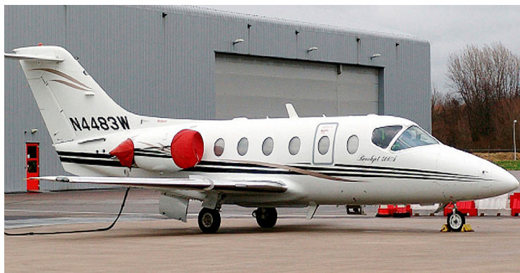
Beechjet 400 Engine Covers