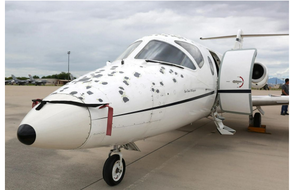
Jayhawk Hail Damage