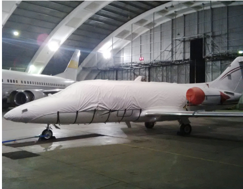
Beechjet 400 Cabin/Nose Cover, Engine Covers

This cover type is made from Silver Acrylic Sunbrella canvas and is 100% lined with a soft and smooth microfiber. Bruce's Custom Covers developed this material combination especially for aircraft protection. The outer material is medium weight and treated for water resistance, UV resistance and anti-static buildup. The inner lining is a very soft and smooth microfiber to prevent scratching. The material is very reflective, and tests show that the cabin interior temperature can be reduced to near-ambient temperature on the hottest of days. It is water, ice and snow repellent, yet breathable to allow moisture to escape from between the cover and the aircraft surface.