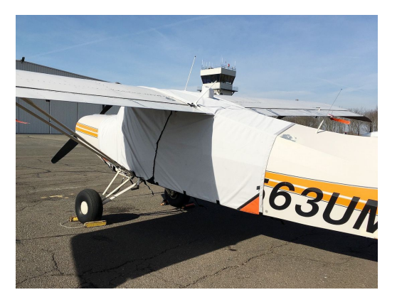
Maule M-5-235C Extended Canopy Cover

This cover type is made from Silver Acrylic Sunbrella canvas and is 100% lined with a soft and smooth microfiber. Bruce's Custom Covers developed this material combination especially for aircraft protection. The outer material is medium weight and treated for water resistance, UV resistance and anti-static buildup. The inner lining is a very soft and smooth microfiber to prevent scratching. The material is very reflective, and tests show that the cabin interior temperature can be reduced to near-ambient temperature on the hottest of days. It is water, ice and snow repellent, yet breathable to allow moisture to escape from between the cover and the aircraft surface.