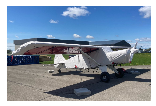
Bearhawk 4-Place Complete Cover Set, AFTER

WINTER USE MATERIAL - Made with Solution-Dyed Polyester fabric, this option is intended for seasonal use to aid in deicing, rain mitigation, or for occasional travel. The material is lighter and more compact, but more susceptible to UV damage and may have a shorter useful life if used continuously outside than the all-year use material.