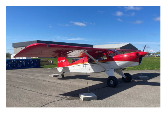
Bearhawk 4-Place Complete Cover Set, BEFORE