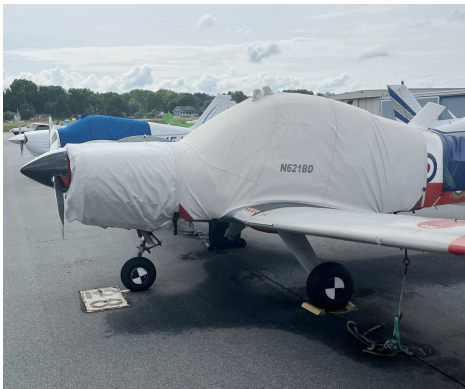
Scottish Aviation Bulldog Canopy & Engine Covers

This cover type is made from Silver Acrylic Sunbrella canvas and is 100% lined with a soft and smooth microfiber. Bruce's Custom Covers developed this material combination especially for aircraft protection. The outer material is medium weight and treated for water resistance, UV resistance and anti-static buildup. The inner lining is a very soft and smooth microfiber to prevent scratching. The material is very reflective, and tests show that the cabin interior temperature can be reduced to near-ambient temperature on the hottest of days. It is water, ice and snow repellent, yet breathable to allow moisture to escape from between the cover and the aircraft surface.