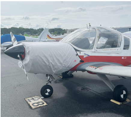
Scottish Aviation Bulldog Engine Cover