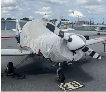
Scottish Aviation Bulldog Canopy & Engine Covers

This cover type is made from Silver Acrylic Sunbrella canvas and is 100% lined with a soft and smooth microfiber. Bruce's Custom Covers developed this material combination especially for aircraft protection. The outer material is medium weight and treated for water resistance, UV resistance and anti-static buildup. The inner lining is a very soft and smooth microfiber to prevent scratching. The material is very reflective, and tests show that the cabin interior temperature can be reduced to near-ambient temperature on the hottest of days. It is water, ice and snow repellent, yet breathable to allow moisture to escape from between the cover and the aircraft surface.