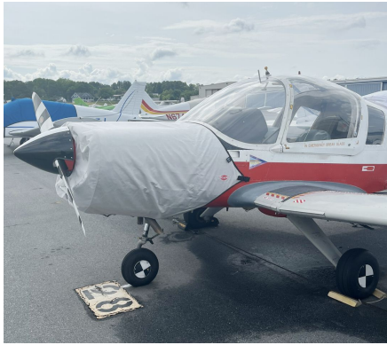
Scottish Aviation Bulldog Engine Cover

This cover type is made from Silver Acrylic Sunbrella canvas and is 100% lined with a soft and smooth microfiber. Bruce's Custom Covers developed this material combination especially for aircraft protection. The outer material is medium weight and treated for water resistance, UV resistance and anti-static buildup. The inner lining is a very soft and smooth microfiber to prevent scratching. The material is very reflective, and tests show that the cabin interior temperature can be reduced to near-ambient temperature on the hottest of days. It is water, ice and snow repellent, yet breathable to allow moisture to escape from between the cover and the aircraft surface.