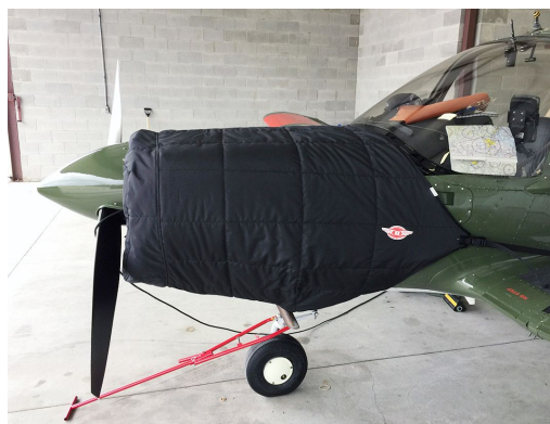
Scottish Aviation Bulldog Insulated Engine Cover