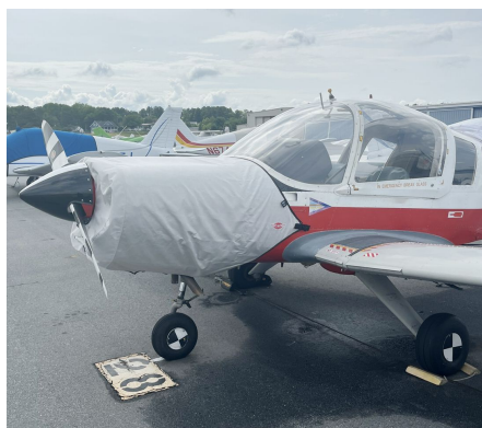
Scottish Aviation Bulldog Engine Cover

This cover type is made from Silver Acrylic Sunbrella canvas and is 100% lined with a soft and smooth microfiber. Bruce's Custom Covers developed this material combination especially for aircraft protection. The outer material is medium weight and treated for water resistance, UV resistance and anti-static buildup. The inner lining is a very soft and smooth microfiber to prevent scratching. The material is very reflective, and tests show that the cabin interior temperature can be reduced to near-ambient temperature on the hottest of days. It is water, ice and snow repellent, yet breathable to allow moisture to escape from between the cover and the aircraft surface.