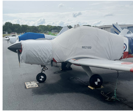
Scottish Aviation Bulldog Canopy & Engine Covers