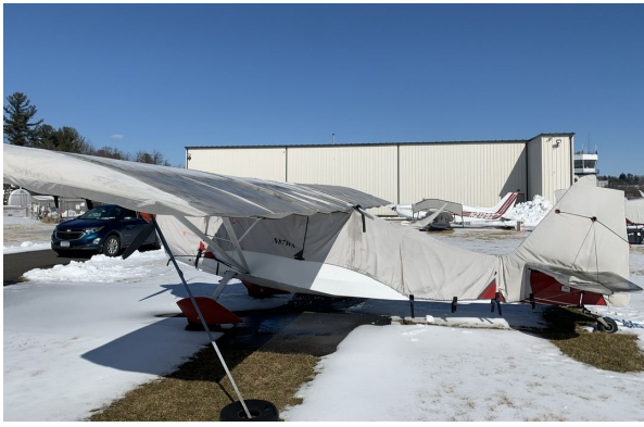
American Champion Decathlon Extended Canopy, Engine, Wing & Empennage Covers