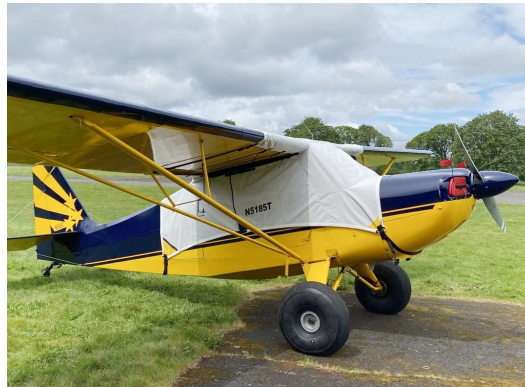
American Champion Citabria canopy cover over the top style, extends to cover gas caps, Engine Plugs