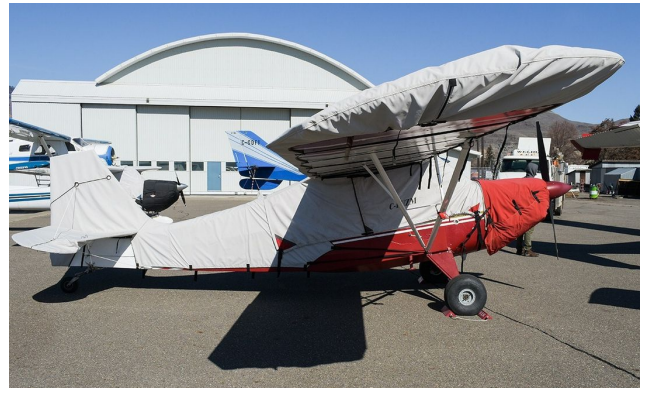
Bellanca Citabria 7ECA Canopy, Empennage & Wing Covers