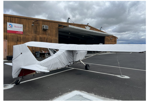
Bellanca Decathlon Full Cover Set