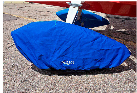
Bellanca Citabria Wheelpant Cover