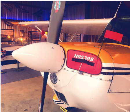
Bellanca Citabria Engine Plugs

Engine Inlet Plugs are custom fit for your Bellanca (American Champion) Decathlon intakes, made with heavy-duty vinyl material, and stuffed with a single block of sculpted urethane foam. Each plug has a zipper that allows the foam to be removed and dried if necessary. Engine plugs have warning flags that are visible from the cockpit or 'remove before flight' streamers sewn onto the face of the plugs. Most plugs are imprinted with the aircraft registration number in black for an extra charge. Storage bag NOT included. Engine plugs may be inserted after flight when the engine is still warm. Engine Inlet Plugs are commonly referred to as Cowl Plugs, Intake Plugs, Cowl Blocks, Engine Blocks, and Engine Bung.