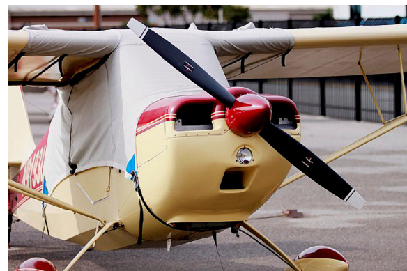
Bellanca Citabria Over-the-Top Canopy Cover, extended to cover gas caps