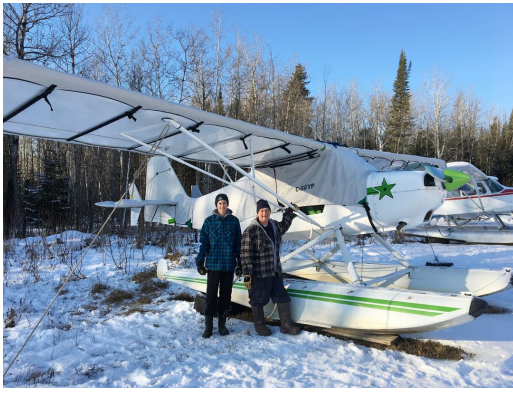
Bellanca Citabria Canopy Cover (extends to tail), Wing Covers, Empennage Covers