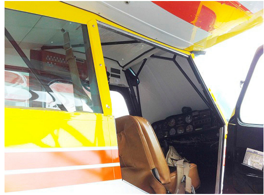
Bellanca Citabria Windshield & Skylight HeatShields