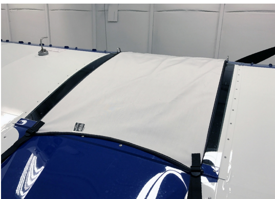
Cub Crafters CC-11 Windshield Cover

This cover type is made from Silver Acrylic Sunbrella canvas and is 100% lined with a soft and smooth microfiber. Bruce's Custom Covers developed this material combination especially for aircraft protection. The outer material is medium weight and treated for water resistance, UV resistance and anti-static buildup. The inner lining is a very soft and smooth microfiber to prevent scratching. The material is very reflective, and tests show that the cabin interior temperature can be reduced to near-ambient temperature on the hottest of days. It is water, ice and snow repellent, yet breathable to allow moisture to escape from between the cover and the aircraft surface.