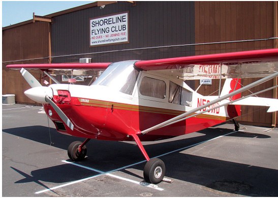
Bellanca Citabria Cabin HeatShield Set

foam with a silver mylar finish. The semi-rigid design is stiff enough to stand along the inside of the windshield using sun visors or window framing. It folds up flat and easily stores in the included storage sleeve. Some designs may require velcro and suction cups or split right and left sides. A Heatshield is an excellent short-term remedy for cockpit overheating. An external fabric cover is far more effective and practical for long-term protection.