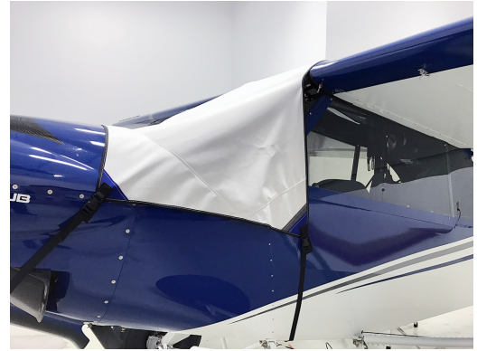
Cub Crafters CC-11 Windshield Cover