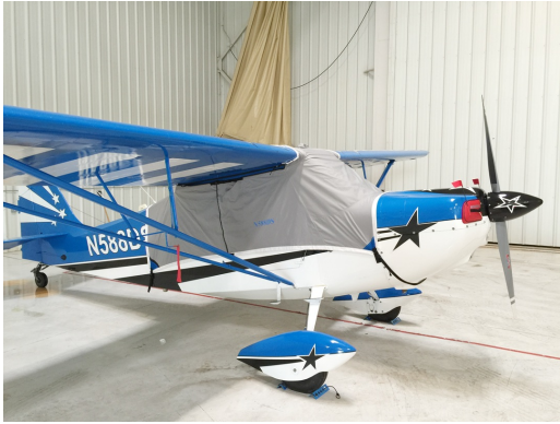
Bellanca Citabria Light Weight Travel Cover, Engine Plugs

This cover type is made from Silver Acrylic Sunbrella canvas and is 100% lined with a soft and smooth microfiber. Bruce's Custom Covers developed this material combination especially for aircraft protection. The outer material is medium weight and treated for water resistance, UV resistance and anti-static buildup. The inner lining is a very soft and smooth microfiber to prevent scratching. The material is very reflective, and tests show that the cabin interior temperature can be reduced to near-ambient temperature on the hottest of days. It is water, ice and snow repellent, yet breathable to allow moisture to escape from between the cover and the aircraft surface.