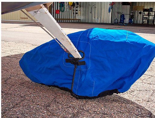
Bellanca Citabria Wheelpant Cover

ALL-YEAR USE MATERIAL - Made with Silver Acrylic Sunbrella canvas, the all-year use material is the best option for sun protection and cover longevity. This heavier more durable material is intended for all weather conditions, such as rain and snow or lots of sun.