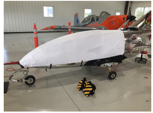
Bede BD-5 Canopy/Nose Cover, test fit cover