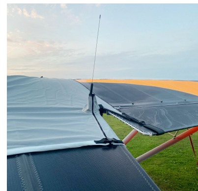
Skyreach Bushcat Travel Weight Canopy Cover