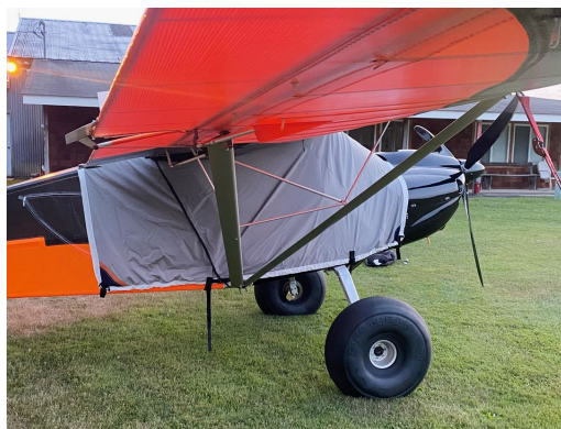
Skyreach Bushcat Travel Weight Canopy Cover

Travel Covers are made with Silver Solution-Dyed Polyester fabric and only lined over the windshield to save weight. The material is lightweight and more compact for easy stowage in the aircraft. The polyester material is water resistant, but only intended for occasional use outside. We also have an ultra lightweight material available for fitted hangar dust covers. For daily outdoor use, the non-travel Sunbrella Cover is the best choice.