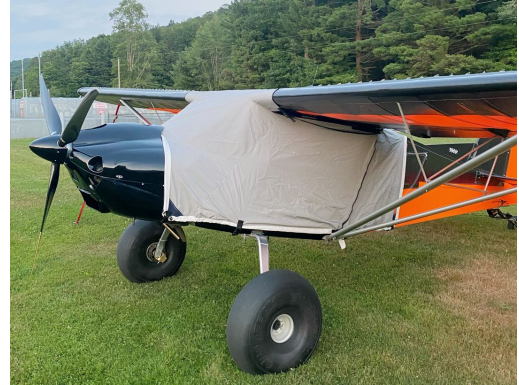
Skyreach Bushcat Travel Weight Canopy Cover