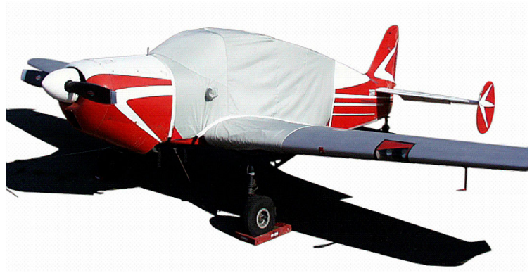
Cruisemaster Extended Canopy Cover w/36" Wing Extensions