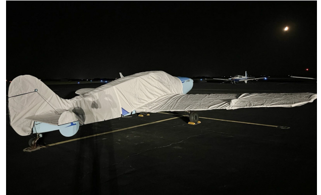
Bellanca Cruisemaster Cover Set