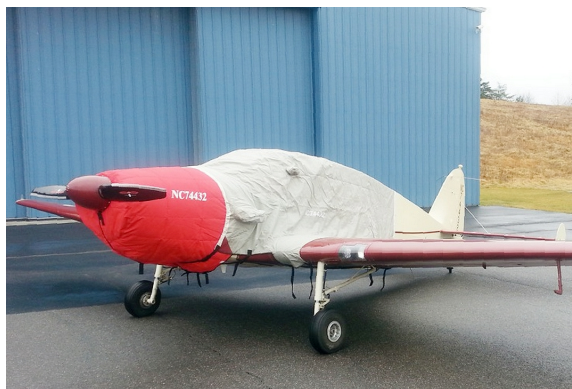
Bellanca Cruisemaster Insulated Engine Cover, Extended Canopy Cover