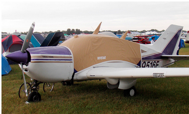
Bellanca Viking Canopy Cover

This cover type is made from Silver Acrylic Sunbrella canvas and is 100% lined with a soft and smooth microfiber. Bruce's Custom Covers developed this material combination especially for aircraft protection. The outer material is medium weight and treated for water resistance, UV resistance and anti-static buildup. The inner lining is a very soft and smooth microfiber to prevent scratching. The material is very reflective, and tests show that the cabin interior temperature can be reduced to near-ambient temperature on the hottest of days. It is water, ice and snow repellent, yet breathable to allow moisture to escape from between the cover and the aircraft surface.