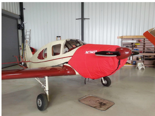
Bellanca Cruisemaster Insulated Engine Cover

This cover type is made from Silver Acrylic Sunbrella canvas and is 100% lined with a soft and smooth microfiber. Bruce's Custom Covers developed this material combination especially for aircraft protection. The outer material is medium weight and treated for water resistance, UV resistance and anti-static buildup. The inner lining is a very soft and smooth microfiber to prevent scratching. The material is very reflective, and tests show that the cabin interior temperature can be reduced to near-ambient temperature on the hottest of days. It is water, ice and snow repellent, yet breathable to allow moisture to escape from between the cover and the aircraft surface.