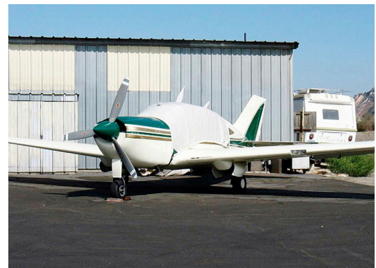
Bellanca Viking Canopy Cover