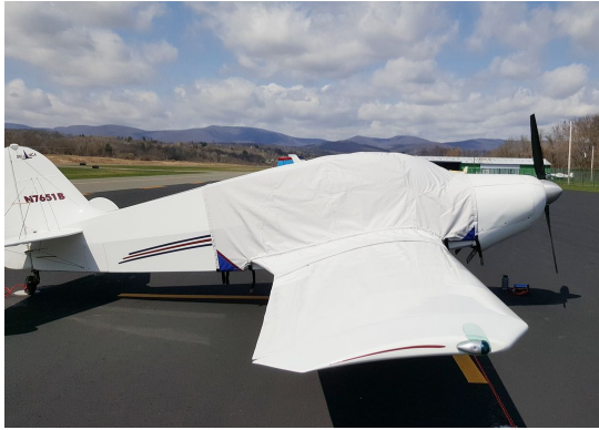
Bellanca Cruisemaster Extended Canopy Cover with 36" Wing Extensions.

This cover type is made from Silver Acrylic Sunbrella canvas and is 100% lined with a soft and smooth microfiber. Bruce's Custom Covers developed this material combination especially for aircraft protection. The outer material is medium weight and treated for water resistance, UV resistance and anti-static buildup. The inner lining is a very soft and smooth microfiber to prevent scratching. The material is very reflective, and tests show that the cabin interior temperature can be reduced to near-ambient temperature on the hottest of days. It is water, ice and snow repellent, yet breathable to allow moisture to escape from between the cover and the aircraft surface.