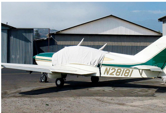
Bellanca Viking Canopy Cover

Travel Covers are made with Silver Solution-Dyed Polyester fabric and only lined over the windshield to save weight. The material is lightweight and more compact for easy stowage in the aircraft. The polyester material is water resistant, but only intended for occasional use outside. We also have an ultra lightweight material available for fitted hangar dust covers. For daily outdoor use, the non-travel Sunbrella Cover is the best choice.