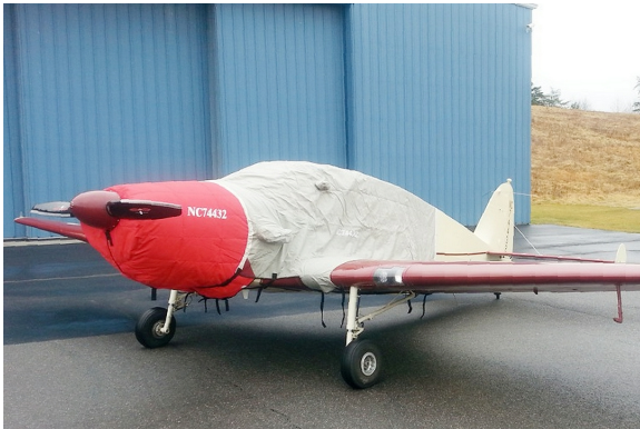
Bellanca Cruisemaster Insulated Engine Cover, Extended Canopy Cover

This cover type is made from Silver Acrylic Sunbrella canvas and is 100% lined with a soft and smooth microfiber. Bruce's Custom Covers developed this material combination especially for aircraft protection. The outer material is medium weight and treated for water resistance, UV resistance and anti-static buildup. The inner lining is a very soft and smooth microfiber to prevent scratching. The material is very reflective, and tests show that the cabin interior temperature can be reduced to near-ambient temperature on the hottest of days. It is water, ice and snow repellent, yet breathable to allow moisture to escape from between the cover and the aircraft surface.