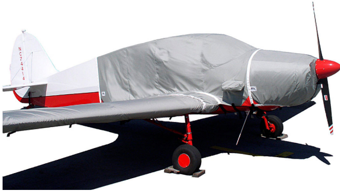
Extended Canopy Cover w/12" Wing Extensions, Engine & Wing Covers

This cover type is made from Silver Acrylic Sunbrella canvas and is 100% lined with a soft and smooth microfiber. Bruce's Custom Covers developed this material combination especially for aircraft protection. The outer material is medium weight and treated for water resistance, UV resistance and anti-static buildup. The inner lining is a very soft and smooth microfiber to prevent scratching. The material is very reflective, and tests show that the cabin interior temperature can be reduced to near-ambient temperature on the hottest of days. It is water, ice and snow repellent, yet breathable to allow moisture to escape from between the cover and the aircraft surface.