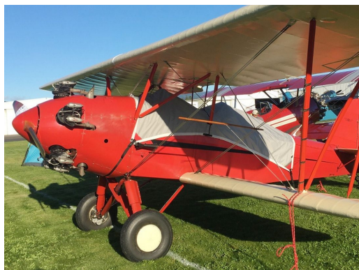
Bird BK Travel Canopy Cover

Travel Covers are made with Silver Solution-Dyed Polyester fabric and only lined over the windshield to save weight. The material is lightweight and more compact for easy stowage in the aircraft. The polyester material is water resistant, but only intended for occasional use outside. We also have an ultra lightweight material available for fitted hangar dust covers. For daily outdoor use, the non-travel Sunbrella Cover is the best choice.