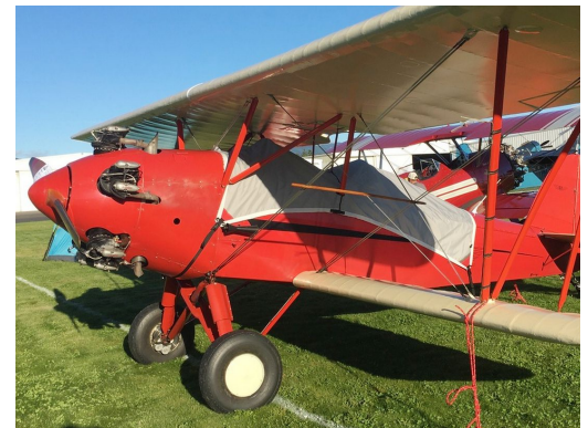
Bird BK Travel Canopy Cover