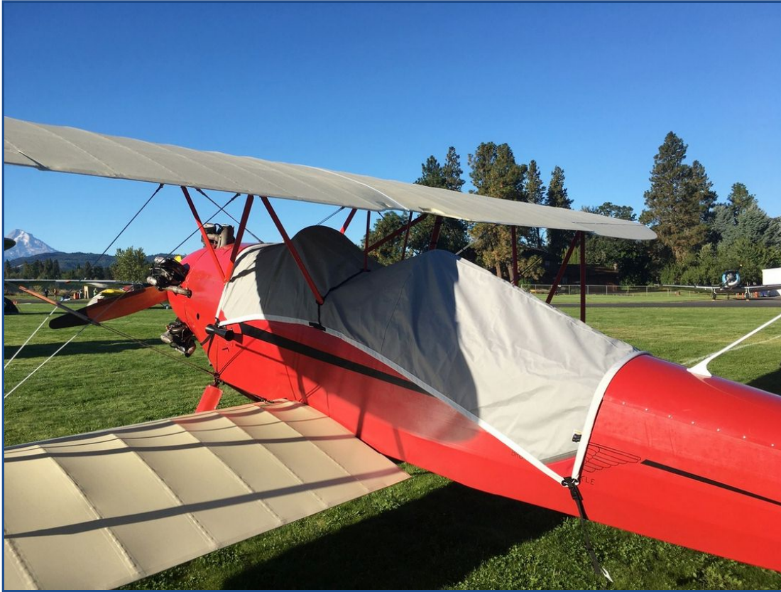
Bird BK Travel Canopy Cover