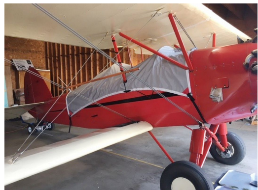
Bird BK Travel Canopy Cover