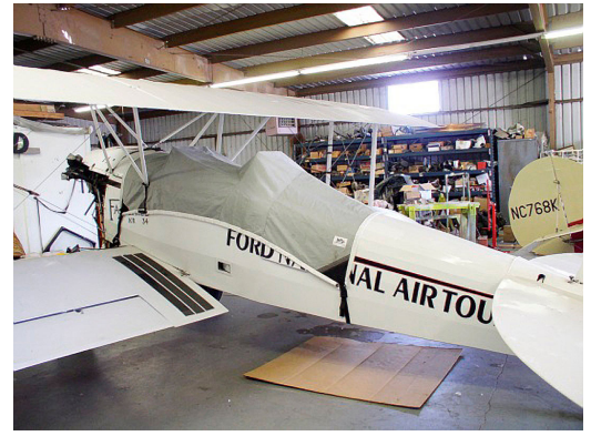
Fairchild KR-34 Canopy Cover