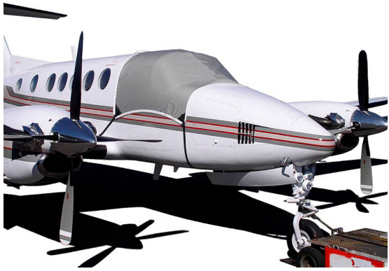
King Air 200/300 Snap-On Windshield Cover