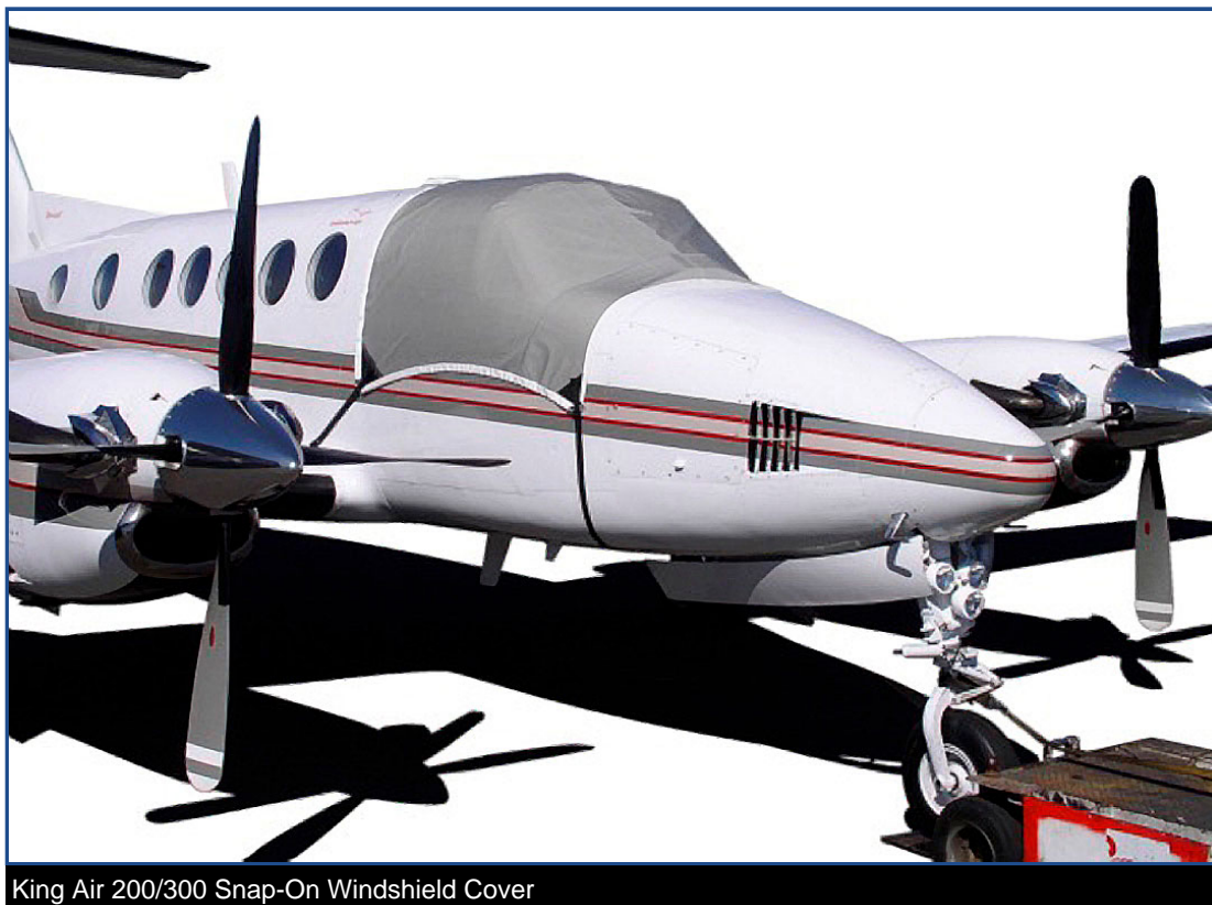
King Air 200/300 Snap-On Windshield Cover