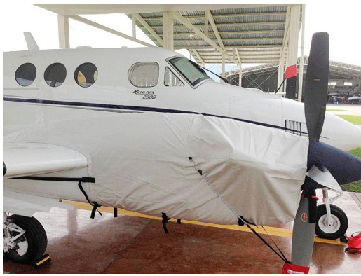
King Air C90 Engine Cover