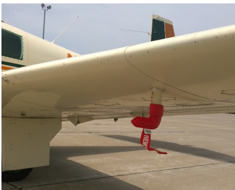
Mooney Pitot Cover

Engine Inlet Plugs are custom fit for your Beech Queen Air 65 & 80 intakes, made with heavy-duty vinyl material, and stuffed with a single block of sculpted urethane foam. Each plug has a zipper that allows the foam to be removed and dried if necessary. Engine plugs have warning flags that are visible from the cockpit or 'remove before flight' streamers sewn onto the face of the plugs. Most plugs are imprinted with the aircraft registration number in black for an extra charge. Storage bag NOT included. Engine plugs may be inserted after flight when the engine is still warm. Engine Inlet Plugs are commonly referred to as Cowl Plugs, Intake Plugs, Cowl Blocks, Engine Blocks, and Engine Bungs.