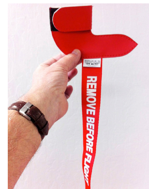
Standard Pitot Cover