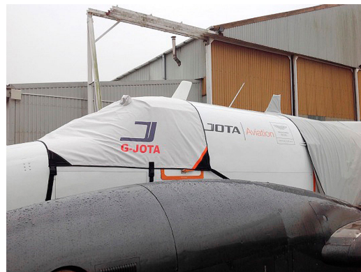
King Air Windshield/Cockpit Cover