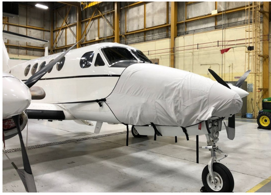
King Air 200 Nose Cover