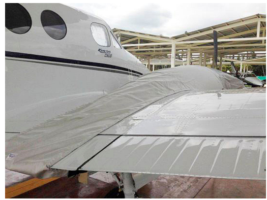
King Air C90 Engine Cover