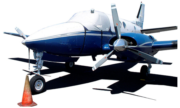
Beech King Air Windshield Cover