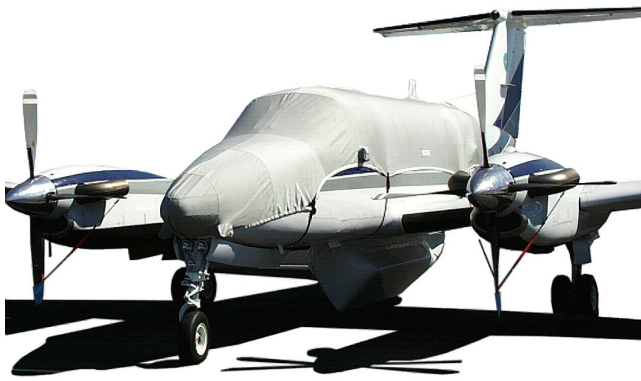
King Air Canopy/Nose Cover