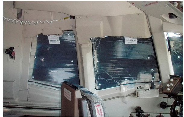
Boeing 767 Cockpit HeatShield set