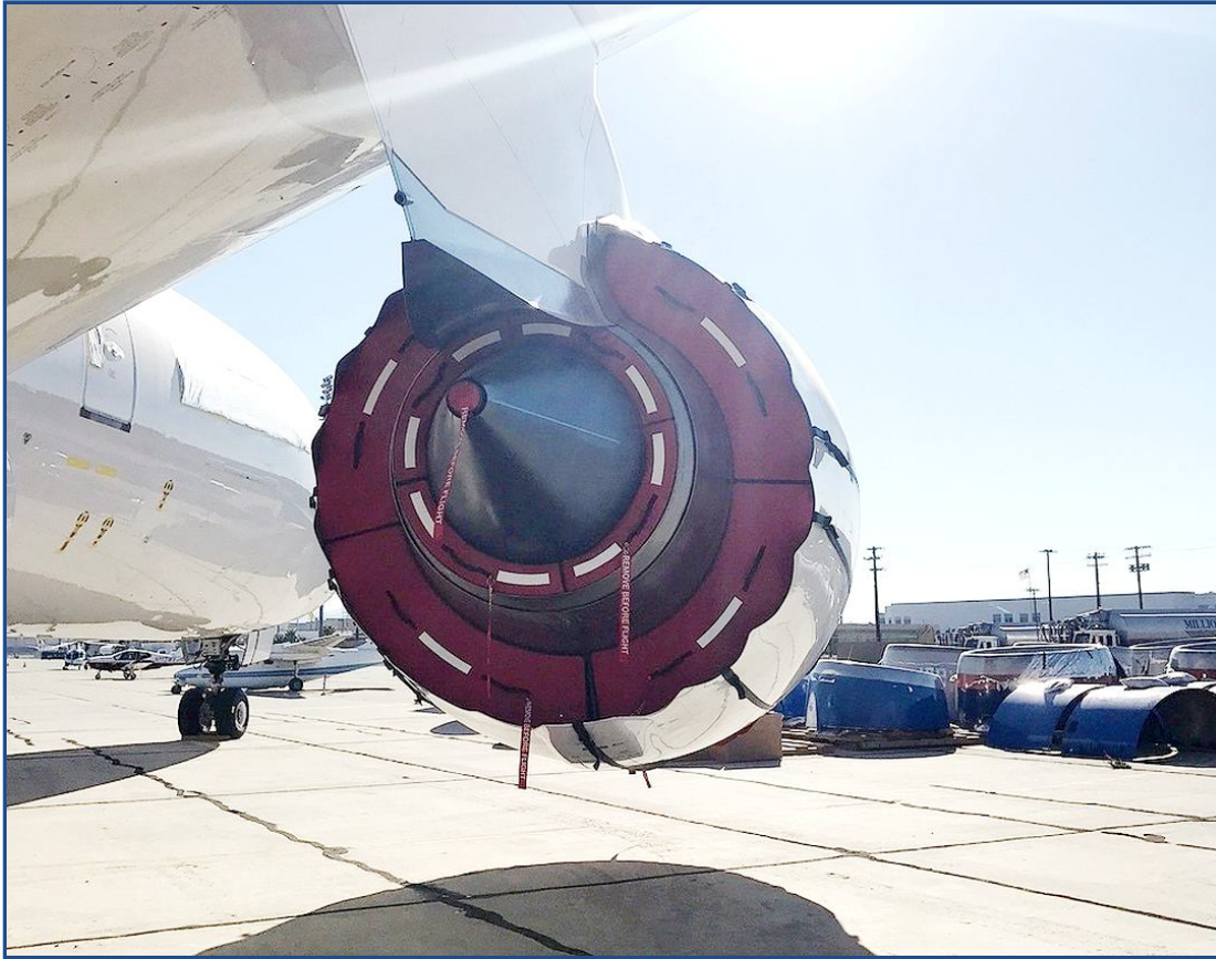
Boeing 787 Dreamliner Bypass Vent, Turbine Exhaust, & Exhaust Nozzle Plugs, Genx Engines