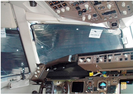
Boeing 767 Cockpit HeatShield set

Cockpit Heatshields are interior sunshades for the aircraft's cockpit. The product is a unique composite of closed-cell foam with a silver mylar finish. The semi-rigid design is stiff enough to stand inside the window framing. The set folds up flat and is easily stored in the included storage sleeve. Some designs may require velcro and suction cups. Our Heatshields for jets are offered white side out because some aircraft manufacturers have issued advisories against reflective window inserts due to potential heat damage. A Heatshield is an excellent short-term remedy for cockpit overheating, but an external fabric cover is more effective for long-term protection.