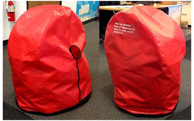
Boeing 757 Tire Covers, great for Wash Prep or Storage