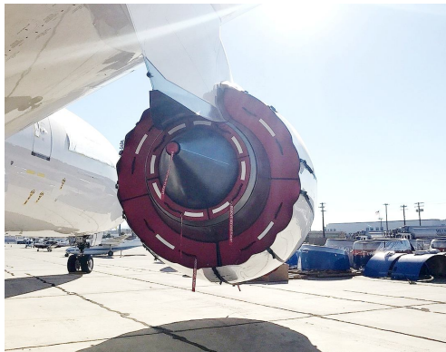
Boeing 787 Dreamliner Bypass Vent, Turbine Exhaust, & Exhaust Nozzle Plugs, Genx Engines

The Engine Exhaust Plugs are custom fit for your Boeing 787 Dreamliner exhaust openings, made with heavy-duty vinyl material, and stuffed with a single block of sculpted urethane foam. Each plug has a zipper that allows the foam to be removed and dried if necessary. Exhaust plugs have 'remove before flight' streamers sewn onto the face of the plugs. Most plugs are imprinted with the aircraft registration number in black for an extra charge. Exhaust plugs may be inserted soon after flight when the engine is still warm. Engine Inlet Plugs are commonly referred to as Cowl Plugs, Intake Plugs, Cowl Blocks, Engine Blocks, and Engine Bungs.