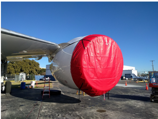
Boeing 787 Intake Cover