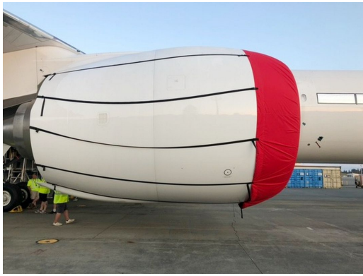
Boeing 777 Intake Covers, GE9X Engine