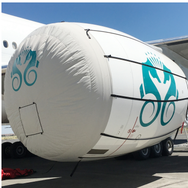
Boeing 777 Intake Covers, GE Engine