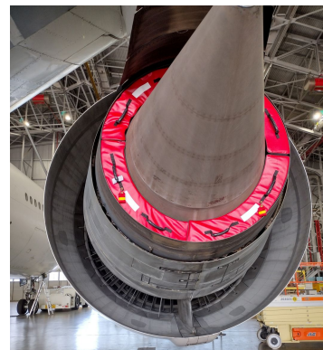
Boeing 777 Bypass Vent & Turbine Exhaust Plugs, Ge90 Engines