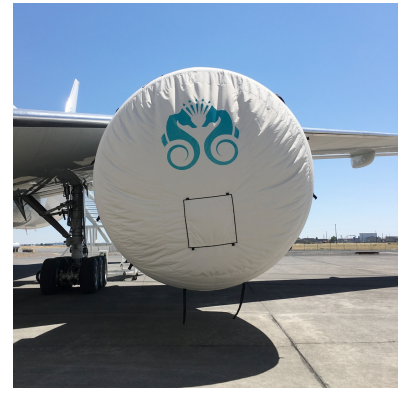
Boeing 777 Intake Covers, GE Engine