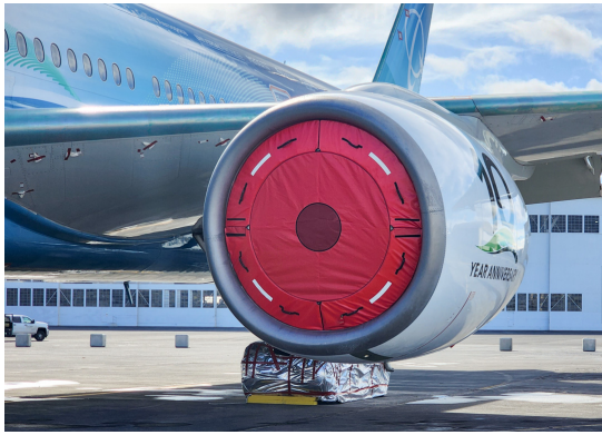
Boeing 777 Intake Plugs, framed, Bi-fold design.