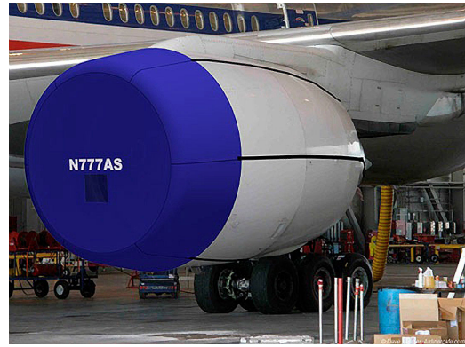
Boeing 777 Intake Cover, GE Engine