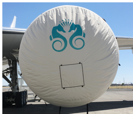
Boeing 777 Intake Covers, GE Engine