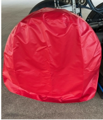
Boeing 777 Main Gear Tire Covers

ALL-YEAR USE MATERIAL - Made with Silver Acrylic Sunbrella canvas, the all-year use material is the best option for sun protection and cover longevity. This heavier more durable material is intended for all weather conditions, such as rain and snow or lots of sun.