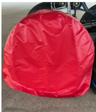
Boeing 777 Main Gear Tire Covers

ALL-YEAR USE MATERIAL - Made with Silver Acrylic Sunbrella canvas, the all-year use material is the best option for sun protection and cover longevity. This heavier more durable material is intended for all weather conditions, such as rain and snow or lots of sun.