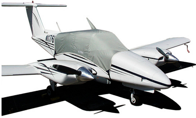
Duchess Standard Canopy Cover