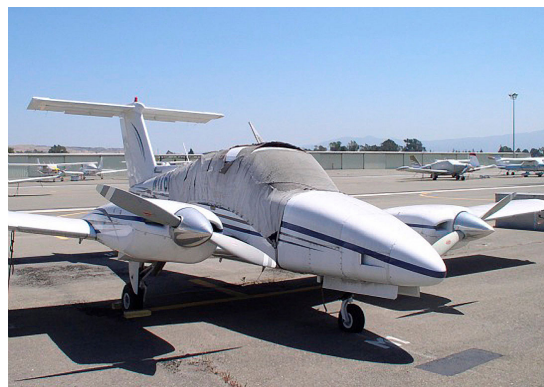
Beech Duchess Canopy Cover

This cover type is made from Silver Acrylic Sunbrella canvas and is 100% lined with a soft and smooth microfiber. Bruce's Custom Covers developed this material combination especially for aircraft protection. The outer material is medium weight and treated for water resistance, UV resistance and anti-static buildup. The inner lining is a very soft and smooth microfiber to prevent scratching. The material is very reflective, and tests show that the cabin interior temperature can be reduced to near-ambient temperature on the hottest of days. It is water, ice and snow repellent, yet breathable to allow moisture to escape from between the cover and the aircraft surface.