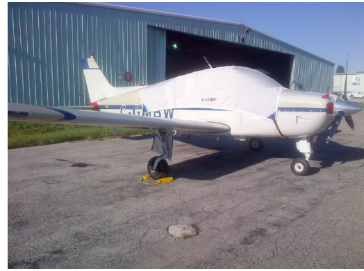
Beech Sierra Canopy Cover, Engine Plugs, Tailcone Cover