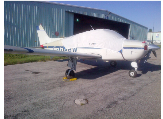
Beech Sierra Canopy Cover, Engine Plugs, Tailcone Cover