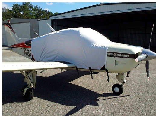
Beech Sport Extended Canopy Cover