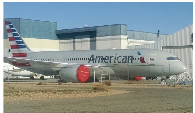
Boeing 757 RB.211 Intake Covers, using existing pit pin locations