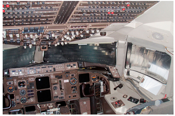
Boeing 757 Cockpit HeatShield set