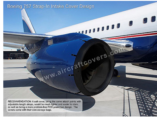
Boeing 757 RB.211 Intake Covers, using existing pit pin locations