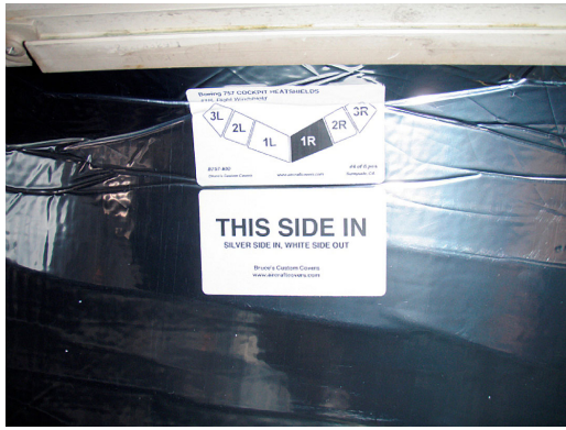
Boeing 757 Cockpit HeatShield set, installation detail