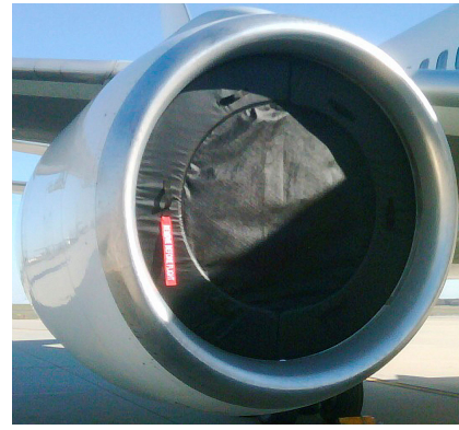
Boeing 757 Intake Plugs, RB.211 Engine (Comes in colors)