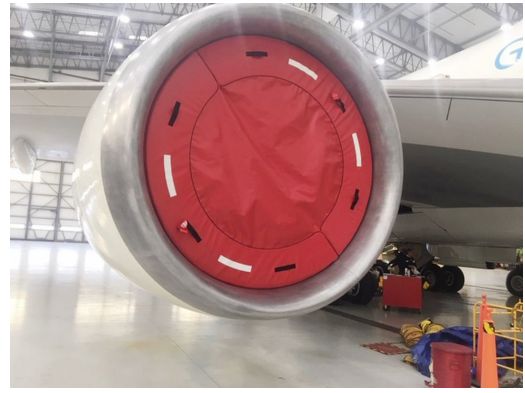
Boeing 747 Intake Plug