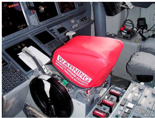
Boeing Throttle Quadrant Cover