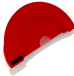
Airbus A330 Intake Plug, framed bi-fold type