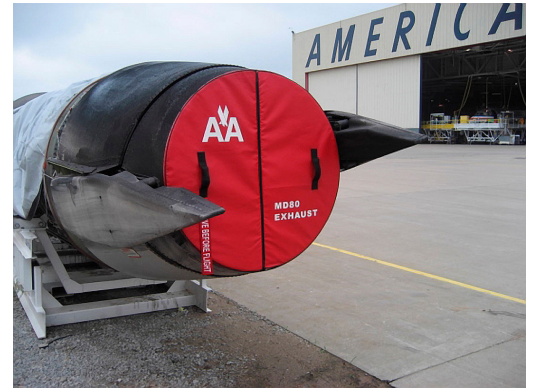
MD80 JT8D Exhaust Plug, Folding Type