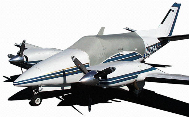
Beech Duke Standard Canopy Cover