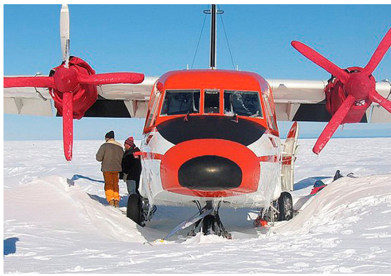
Casa 212 Insulated Engine & Propellor/Spinner Covers