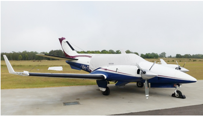
Beech Duke Canopy Cover