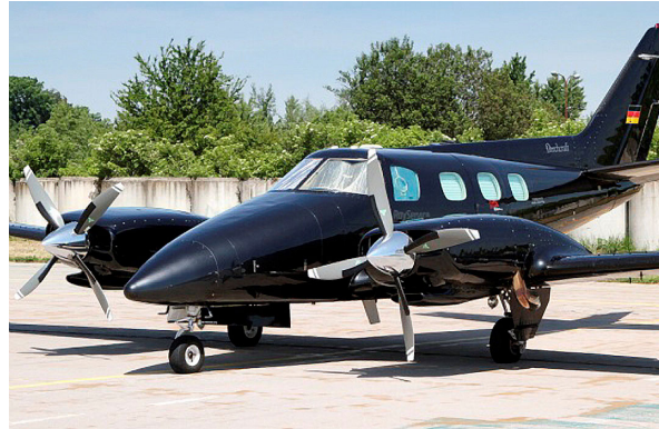
Beech Duke Cockpit HeatShields

Windshield Heatshields are interior sunshades for an aircraft's front windshield. The product is a unique composite of closed-cell foam with a silver mylar finish. The semi-rigid design is stiff enough to stand along the inside of the windshield using sun visors or window framing. It folds up flat and easily stores in the included storage sleeve. Some designs may require velcro and suction cups or split right and left sides. A Heatshield is an excellent short-term remedy for cockpit overheating. An external fabric cover is far more effective and practical for long-term protection.