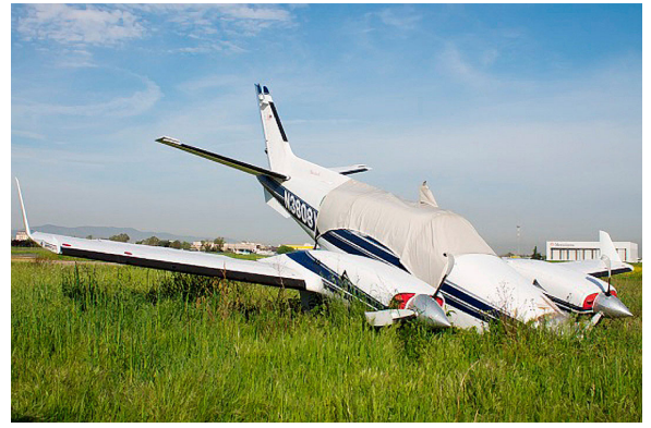
Beech Duke Canopy Cover & Engine Plugs