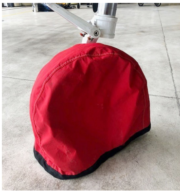
Beech King Air 300 Tire Covers (nose gear)