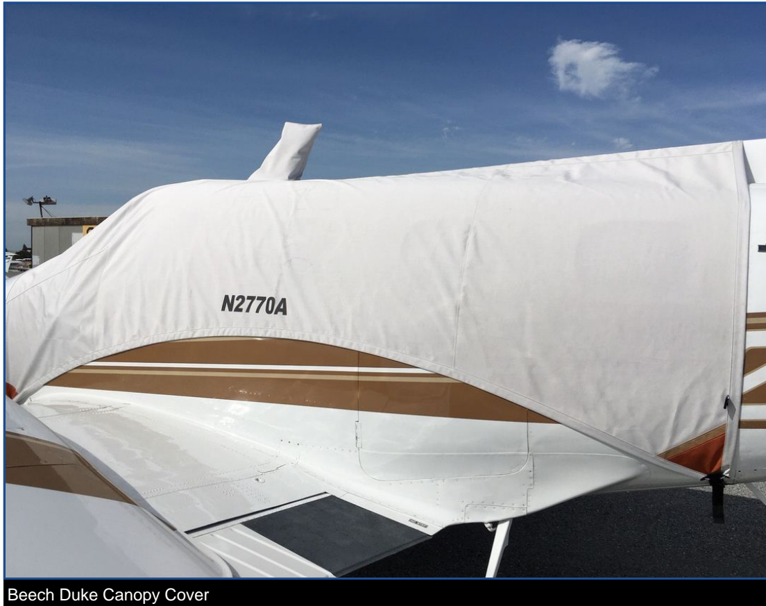
Beech Duke Canopy Cover