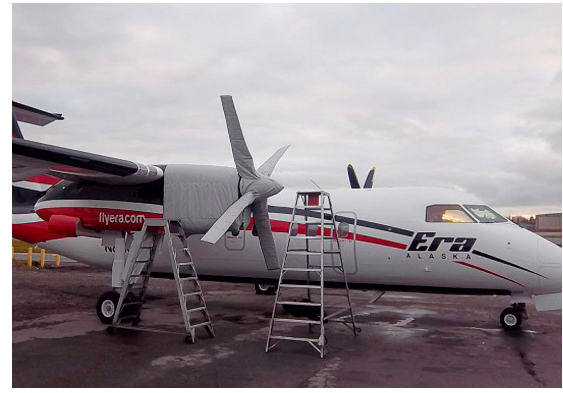
Dash 8 Insulated Engine & Prop Covers