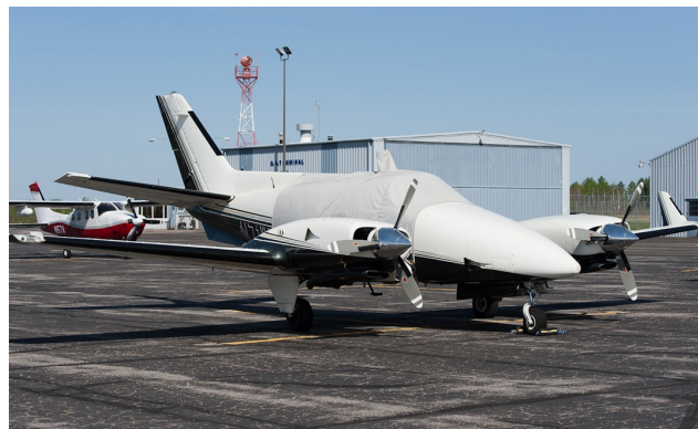
Beech Duke Canopy Cover