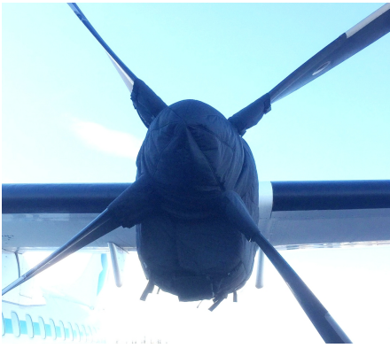
ATR-72-202 Insulated Engine & Prop Hub Covers