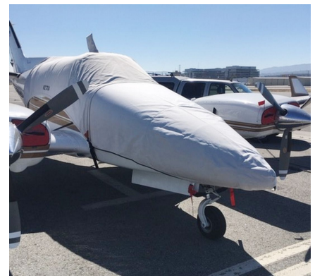
Beech Duke B-60 Nose Cover