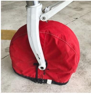
Beech King Air 300 Tire Covers (nose gear)