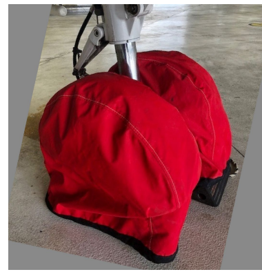
Beech King Air 300 Tire Covers (main gear)