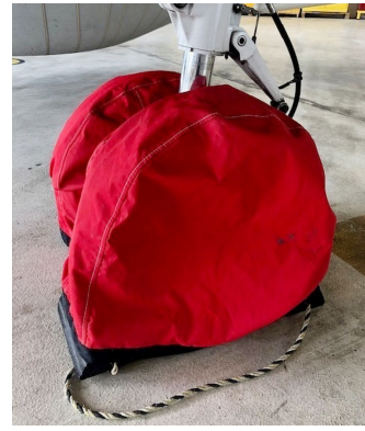
Beech King Air 300 Tire Covers (main gear)