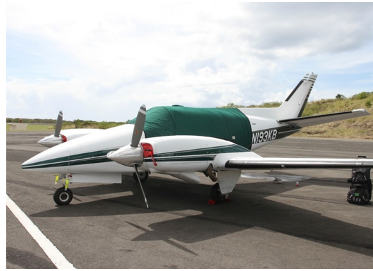
Beech Duke Canopy Cover, Engine Plugs