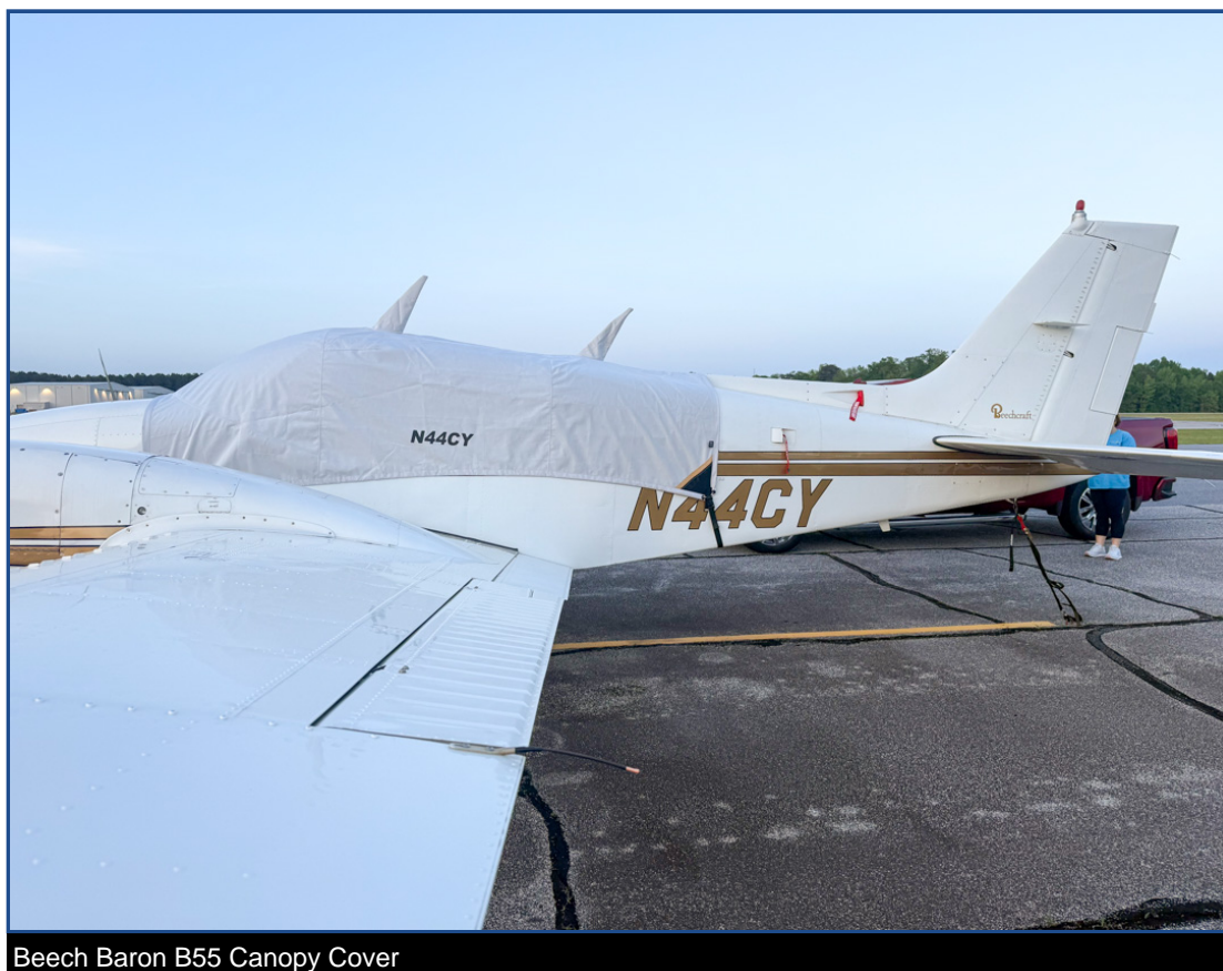
Beech Baron B55 Canopy Cover