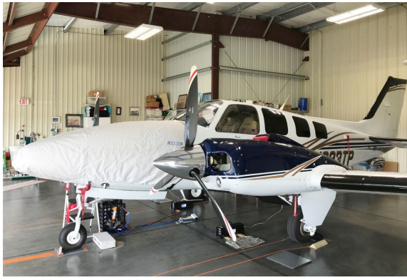
Beech Baron G58 Nose Cover