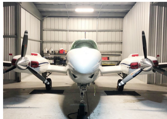
Beech Baron Engine Plugs