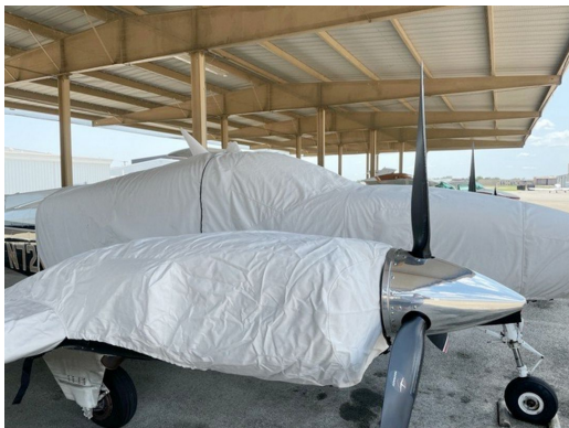
Beech Baron 58P Extended Canopy/Nose Cover, Wing/Engine Covers (test fit)

WINTER USE MATERIAL - Made with Solution-Dyed Polyester fabric, this option is intended for seasonal use to aid in deicing, rain mitigation, or for occasional travel. The material is lighter and more compact, but more susceptible to UV damage and may have a shorter useful life if used continuously outside than the all-year use material.