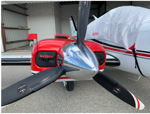
Beech Baron G58 Engine Inlet Plugs