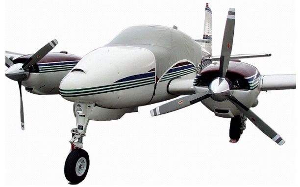
Twin Bonanza Standard Canopy Cover