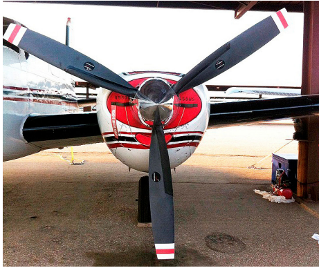
Beech Twin Bonanza Engine Inlet Plugs