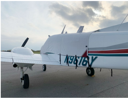
Beech Twin Bonanza Canopy/Nose Cover

This cover type is made from Silver Acrylic Sunbrella canvas and is 100% lined with a soft and smooth microfiber. Bruce's Custom Covers developed this material combination especially for aircraft protection. The outer material is medium weight and treated for water resistance, UV resistance and anti-static buildup. The inner lining is a very soft and smooth microfiber to prevent scratching. The material is very reflective, and tests show that the cabin interior temperature can be reduced to near-ambient temperature on the hottest of days. It is water, ice and snow repellent, yet breathable to allow moisture to escape from between the cover and the aircraft surface.