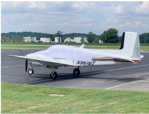
Beech Twin Bonanza Canopy/Nose Cover, test fit cover

This cover type is made from Silver Acrylic Sunbrella canvas and is 100% lined with a soft and smooth microfiber. Bruce's Custom Covers developed this material combination especially for aircraft protection. The outer material is medium weight and treated for water resistance, UV resistance and anti-static buildup. The inner lining is a very soft and smooth microfiber to prevent scratching. The material is very reflective, and tests show that the cabin interior temperature can be reduced to near-ambient temperature on the hottest of days. It is water, ice and snow repellent, yet breathable to allow moisture to escape from between the cover and the aircraft surface.