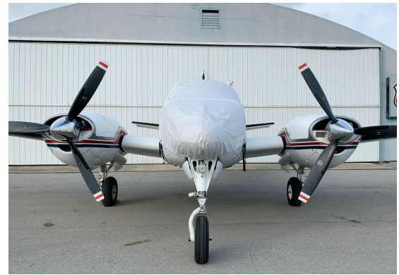
Beech Twin Bonanza Canopy/Nose Cover