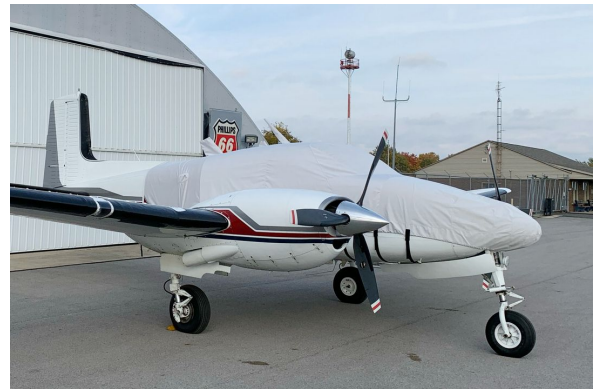
Beech Twin Bonanza Canopy/Nose Cover