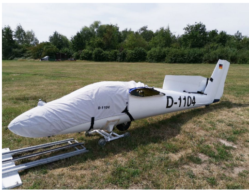
Pilatus B-4 Canopy/Nose Cover