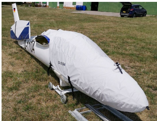
Pilatus B-4 Canopy/Nose Cover