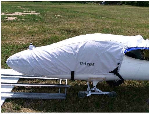
Pilatus B-4 Canopy/Nose Cover