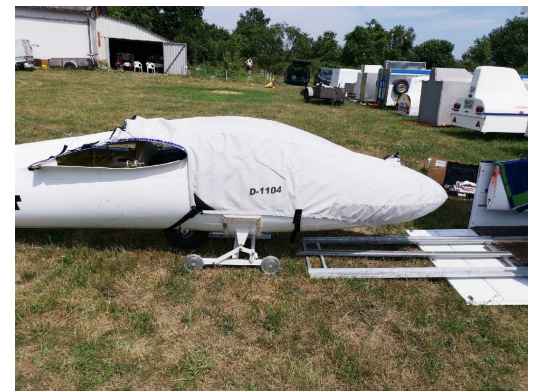
Pilatus B-4 Canopy/Nose Cover