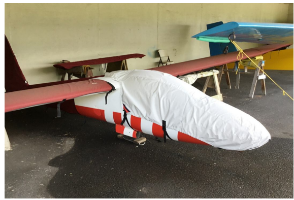
Pilatus B4 Canopy/Nose Cover