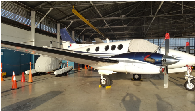
Raytheon Beech King Air Cockpit Cover, Prop Tie/Exhaust Covers, Inlet Plugs

The material is very reflective, and tests show that the cabin interior temperature can be reduced to near-ambient temperature on the hottest of days. It is water, ice and snow repellent, yet breathable to allow moisture to escape from between the cover and the aircraft surface.