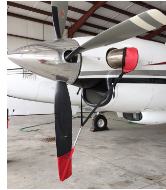
Beech King Air 350 Prop Tie-Downs/Exhaust Covers Combination