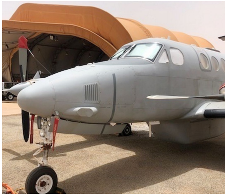
Beech King Air Cockpit HeatShields

Cockpit Heatshields are interior sunshades for the aircraft's cockpit. The product is a unique composite of closed-cell foam with a silver mylar finish. The semi-rigid design is stiff enough to stand inside the window framing. The set folds up flat and is easily stored in the included storage sleeve. Some designs may require velcro and suction cups. A Heatshield is an excellent short-term remedy for cockpit overheating, but an external fabric cover is more effective for long-term protection.