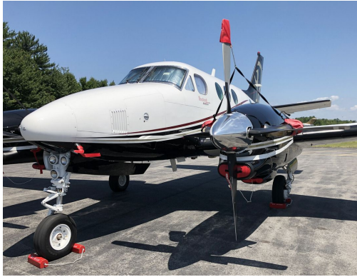
Beech C90A Prop Tie Downs/Exhaust Covers

single block of sculpted urethane foam. Each plug has a zipper that allows the foam to be removed and dried if necessary. Engine plugs have warning flags that are visible from the cockpit or 'remove before flight' streamers sewn onto the face of the plugs. Most plugs are imprinted with the aircraft registration number in black for an extra charge. Storage bag NOT included. Engine plugs may be inserted after flight when the engine is still warm. Engine Inlet Plugs are commonly referred to as Cowl Plugs, Intake Plugs, Cowl Blocks, Engine Blocks, and Engine Bungs.