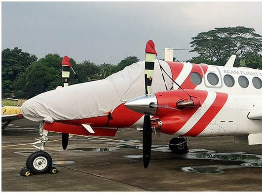
Beech King Air 200 Cockpit/Nose Cover