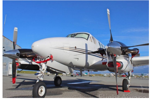
King Air C90A Engine Plugs and Pitot Covers