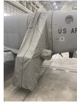
King Air Airstair Door Cover