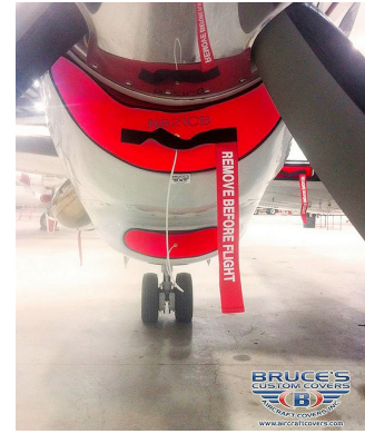
Engine and Oil Cooler Inlet Plugs