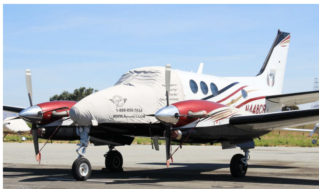
King Air Cockpit/Nose