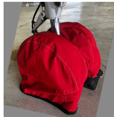
Beech King Air 300 Tire Covers (main gear)