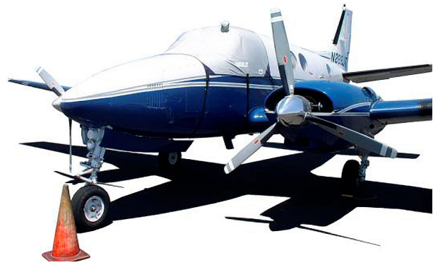
King Air Cockpit Cover, belly-strap type