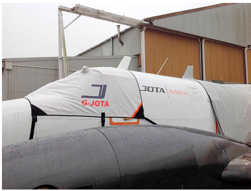
King Air Windshield/Cockpit Cover