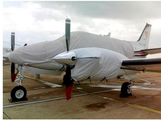
King Air C90 Canopy/Nose Cover, Engine Covers