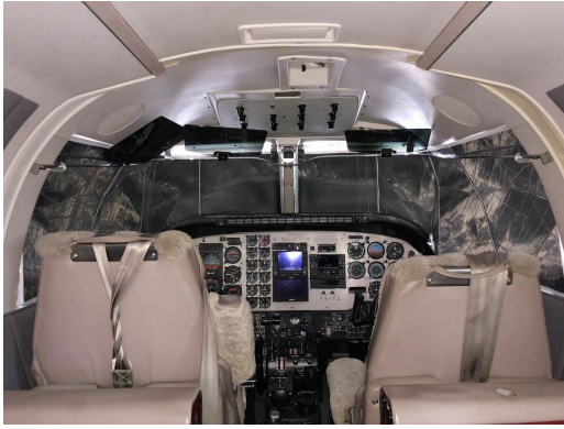
Beech King Air 90 & 100 (U-21, RU-21, T-44) Cockpit Heatshields

for cockpit overheating, but an external fabric cover is more effective for long-term protection.