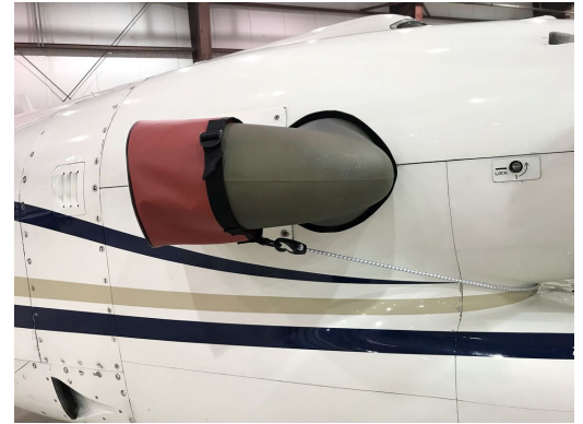
Beech King Air 350 Exhaust Covers