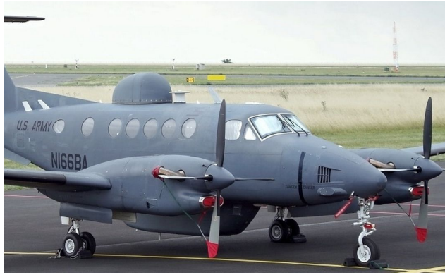
Beech King Air 300 Cockpit HeatShields, Engine Plugs, Prop Ties

be inserted after flight when the engine is still warm. Engine Inlet Plugs are commonly referred to as Cowl Plugs, Intake Plugs, Cowl Blocks, Engine Blocks, and Engine Bunges.