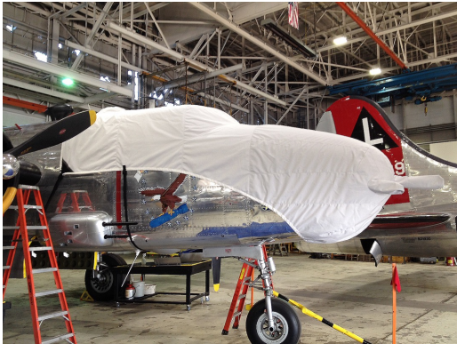
B25 Cockpit/Nose Cover

This cover type is made from Silver Acrylic Sunbrella canvas and is 100% lined with a soft and smooth microfiber. Bruce's Custom Covers developed this material combination especially for aircraft protection. The outer material is medium weight and treated for water resistance, UV resistance and anti-static buildup. The inner lining is a very soft and smooth microfiber to prevent scratching. The material is very reflective, and tests show that the cabin interior temperature can be reduced to near-ambient temperature on the hottest of days. It is water, ice and snow repellent, yet breathable to allow moisture to escape from between the cover and the aircraft surface.