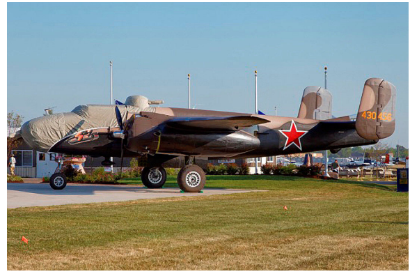
B26 Cockpit/Nose and Gun Turret Covers