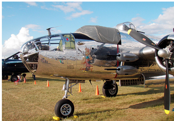
Mitchell B25 Cockpit Cover (Snap-On Type)

This cover type is made from Silver Acrylic Sunbrella canvas and is 100% lined with a soft and smooth microfiber. Bruce's Custom Covers developed this material combination especially for aircraft protection. The outer material is medium weight and treated for water resistance, UV resistance and anti-static buildup. The inner lining is a very soft and smooth microfiber to prevent scratching. The material is very reflective, and tests show that the cabin interior temperature can be reduced to near-ambient temperature on the hottest of days. It is water, ice and snow repellent, yet breathable to allow moisture to escape from between the cover and the aircraft surface.