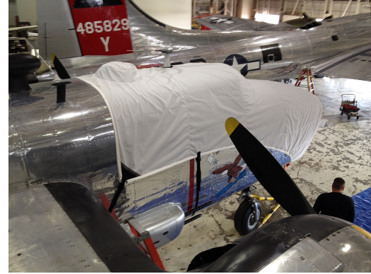
B25 Cockpit/Nose Cover