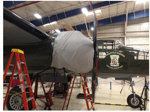
B25 Engine Cover