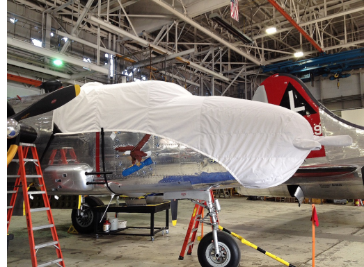
B25 Cockpit/Nose Cover