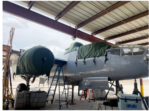
Mitchell B25 Cockpit, Turret & Engine Covers