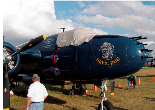
Mitchell B25 Cockpit Cover w/ Custom Imprint (Bellystrap Type)