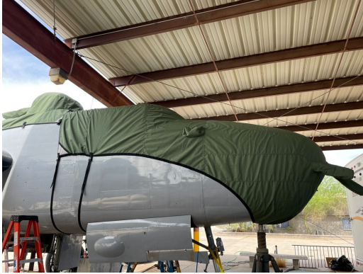
Mitchell B25 Cockpit/Nose Cover, & Turret Cover

This cover type is made from Silver Acrylic Sunbrella canvas and is 100% lined with a soft and smooth microfiber. Bruce's Custom Covers developed this material combination especially for aircraft protection. The outer material is medium weight and treated for water resistance, UV resistance and anti-static buildup. The inner lining is a very soft and smooth microfiber to prevent scratching. The material is very reflective, and tests show that the cabin interior temperature can be reduced to near-ambient temperature on the hottest of days. It is water, ice and snow repellent, yet breathable to allow moisture to escape from between the cover and the aircraft surface.