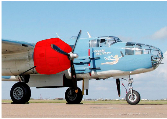
B25 Engine Cover, Illustration