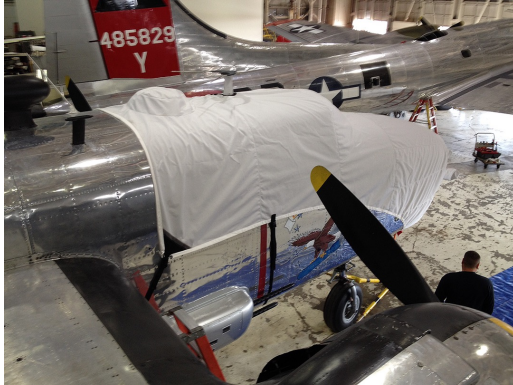
B25 Cockpit/Nose Cover

This cover type is made from Silver Acrylic Sunbrella canvas and is 100% lined with a soft and smooth microfiber. Bruce's Custom Covers developed this material combination especially for aircraft protection. The outer material is medium weight and treated for water resistance, UV resistance and anti-static buildup. The inner lining is a very soft and smooth microfiber to prevent scratching. The material is very reflective, and tests show that the cabin interior temperature can be reduced to near-ambient temperature on the hottest of days. It is water, ice and snow repellent, yet breathable to allow moisture to escape from between the cover and the aircraft surface.