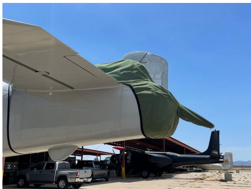
Mitchell B25 Tail Gunner Cover