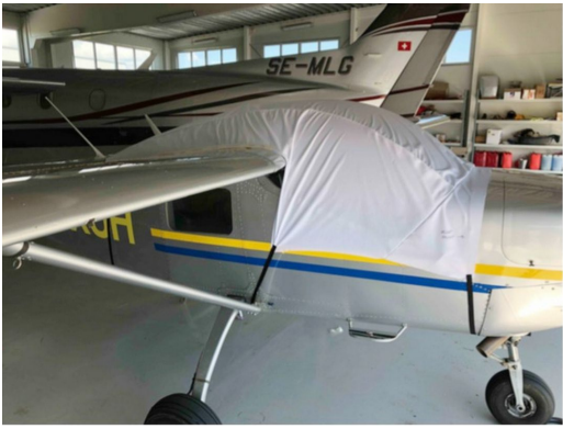
Saab Safari Canopy Cover, test fit cover