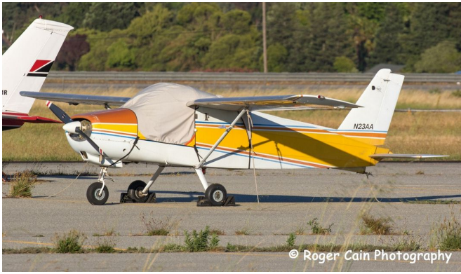
Bolkow Junior 208 Canopy Cover