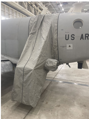
King Air Airstair Coor Cover