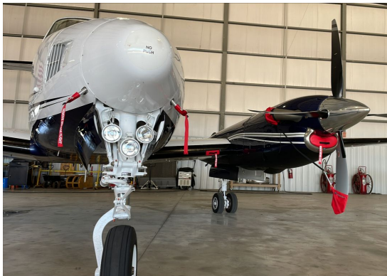
King Air 200 Prop Tie/Exhaust Covers, Engine Plugs & Pitot Tubes

Engine Inlet Plugs are custom fit for your Beech King Air 200, 250, 260 (C-12, RC-12, UC-12) intakes, made with heavy-duty vinyl material, and stuffed with a single block of sculpted urethane foam. Each plug has a zipper that allows the foam to be removed and dried if necessary. Engine plugs have warning flags that are visible from the cockpit or 'remove before flight' streamers sewn onto the face of the plugs. Most plugs are imprinted with the aircraft registration number in black for an extra charge. Storage bag NOT included. Engine plugs may be inserted after flight when the engine is still warm. Engine Inlet Plugs are commonly referred to as Cowl Plugs, Intake Plugs, Cowl Blocks, Engine Blocks, and Engine Bunges.