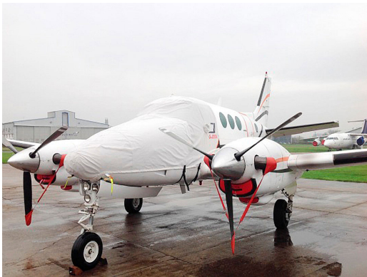
King Air Cockpit/Nose Cover, Plugs, Prop Tie/Exhaust Covers