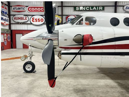
King Air 300 Prop-Tie Downs/Exhaust Covers (set of 6)

This cover type is made from Silver Acrylic Sunbrella canvas and is 100% lined with a soft and smooth microfiber. Bruce's Custom Covers developed this material combination especially for aircraft protection. The outer material is medium weight and treated for water resistance, UV resistance and anti-static buildup. The inner lining is a very soft and smooth microfiber to prevent scratching. The material is very reflective, and tests show that the cabin interior temperature can be reduced to near-ambient temperature on the hottest of days. It is water, ice and snow repellent, yet breathable to allow moisture to escape from between the cover and the aircraft surface.