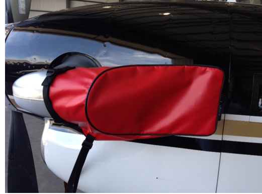
King Air Exhaust Stack Cover