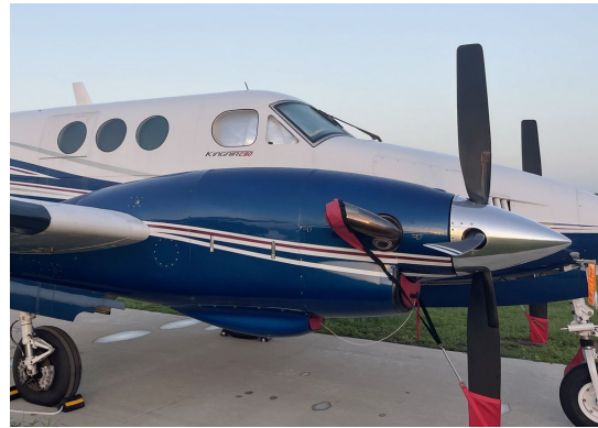
Beech King Air C90 Cockpit HeatShields