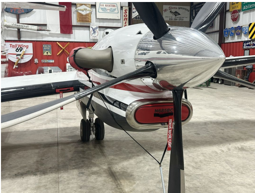
King Air B300 Engine Inlet Plugs (set of 2)

Engine Inlet Plugs are custom fit for your Beech King Air 200, 250, 260 (C-12, RC-12, UC-12) intakes, made with heavy-duty vinyl material, and stuffed with a single block of sculpted urethane foam. Each plug has a zipper that allows the foam to be removed and dried if necessary. Engine plugs have warning flags that are visible from the cockpit or 'remove before flight' streamers sewn onto the face of the plugs. Most plugs are imprinted with the aircraft registration number in black for an extra charge. Storage bag NOT included. Engine plugs may be inserted after flight when the engine is still warm. Engine Inlet Plugs are commonly referred to as Cowl Plugs, Intake Plugs, Cowl Blocks, Engine Blocks, and Engine Bunges.