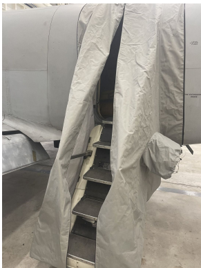
King Air Airstair Coor Cover

WINTER USE MATERIAL - Made with Solution-Dyed Polyester fabric, this option is intended for seasonal use to aid in deicing, rain mitigation, or for occasional travel. The material is lighter and more compact, but more susceptible to UV damage and may have a shorter useful life if used continuously outside than the all-year use material.