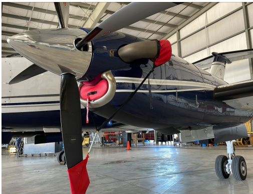
King Air 200 Prop Tie/Exhaust Covers & Engine Plugs