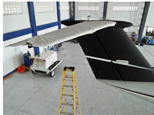
Beech King Air B350 Horizontal Stabilizer Covers