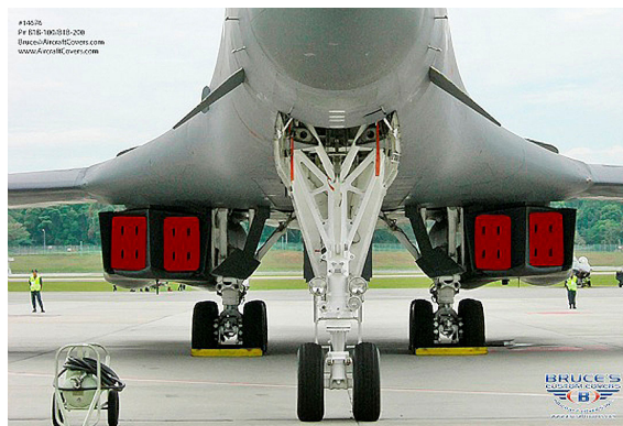
B1-B Bomber Intake Plugs