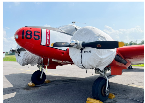
Beech 18 Engine Covers, non-insulated