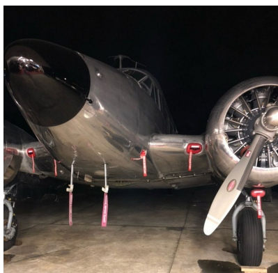
Beech 18 Engine & Oil Cooler Inlet Plugs