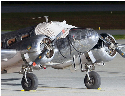
Beech D18S Cockpit Cover

This cover type is made from Silver Acrylic Sunbrella canvas and is 100% lined with a soft and smooth microfiber. Bruce's Custom Covers developed this material combination especially for aircraft protection. The outer material is medium weight and treated for water resistance, UV resistance and anti-static buildup. The inner lining is a very soft and smooth microfiber to prevent scratching. The material is very reflective, and tests show that the cabin interior temperature can be reduced to near-ambient temperature on the hottest of days. It is water, ice and snow repellent, yet breathable to allow moisture to escape from between the cover and the aircraft surface.