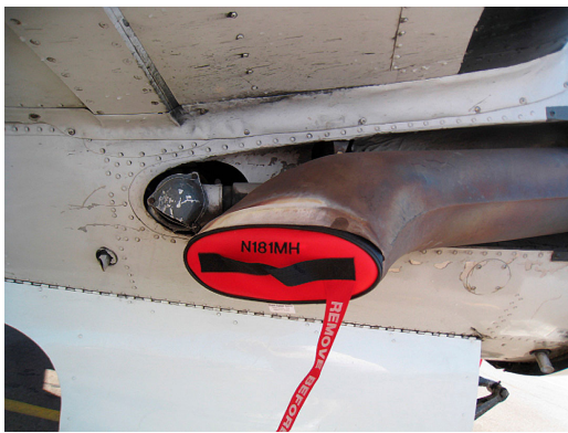
Beech 18 Exhaust Plugs