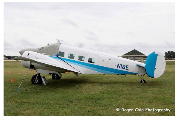
Twin Beech 18 Cockpit/Nose Cover