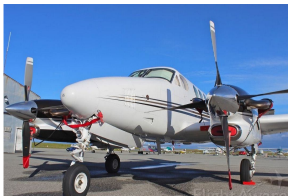
King Air C90A Engine Plugs and Pitot Covers