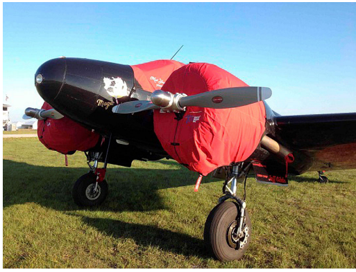
Twin Beech 18 Cockpit & Engine Covers, Younkin Airshow model