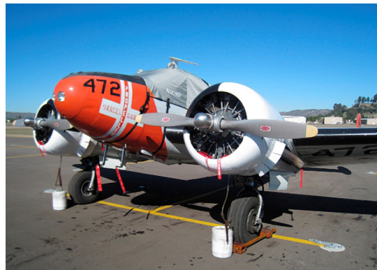
Beech 18 Cockpit Cover and Carb Air Inlet Plugs