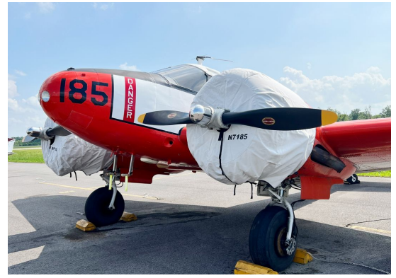
Beech 18 Engine Covers, non-insulated