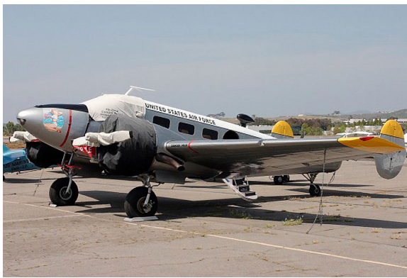
Twin Beech 18 Cockpit, Engine & Prop Covers