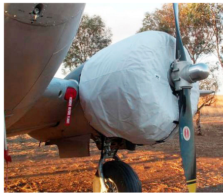
Beech D-18 Engine Covers, Center Section Oil Cooler Inlet Plugs, and Pitot Covers