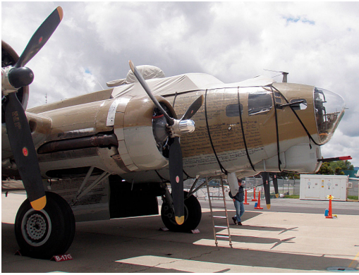
B-17 Canopy/Gun Turret Cover

the hottest of days. It is water, ice and snow repellent, yet breathable to allow moisture to escape from between the cover and the aircraft surface.