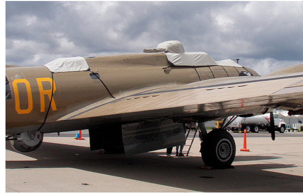
B-17 Canopy/Gun Turret Cover & Hatch Cover