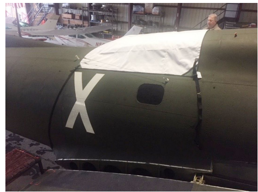
Hatch Cover on a classic B17.