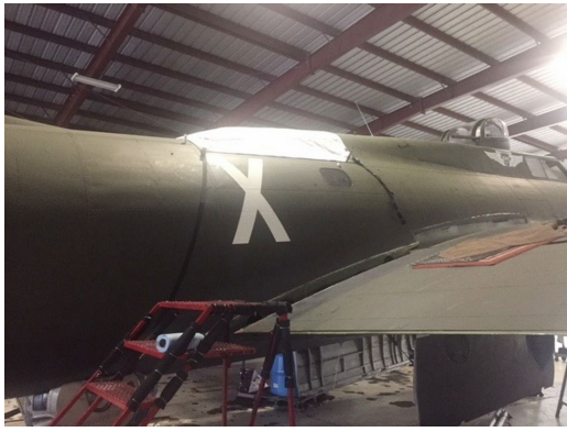
Hatch Cover on a classic B17.