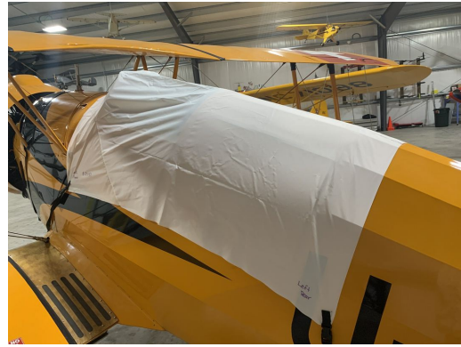
Bucher BU-133 Jungmeister Canopy Cover, test fit cover