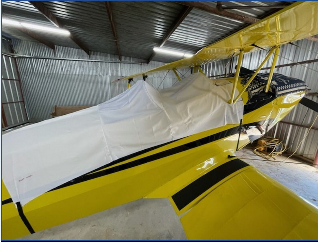
Bucker Jungmann BU-131 Canopy Cover, test fit cover