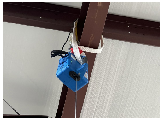
Stearman PT-13 Full Body Dust Cover, Remote Control Winch