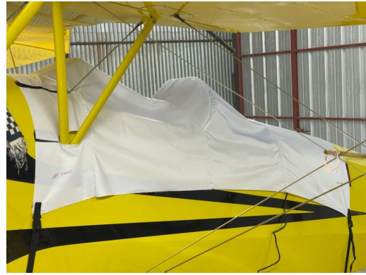
Bucker Jungmann BU-131 Canopy Cover, test fit cover