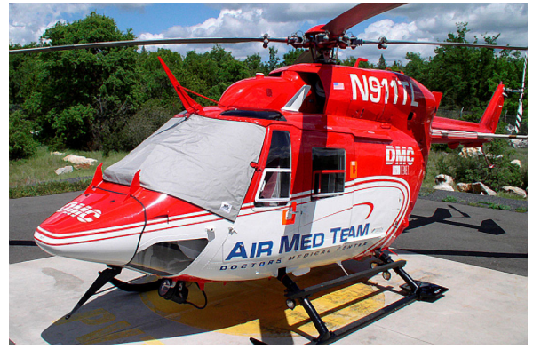
BK-117 Windshield Cover