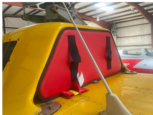
BO 105CB Intake Plug