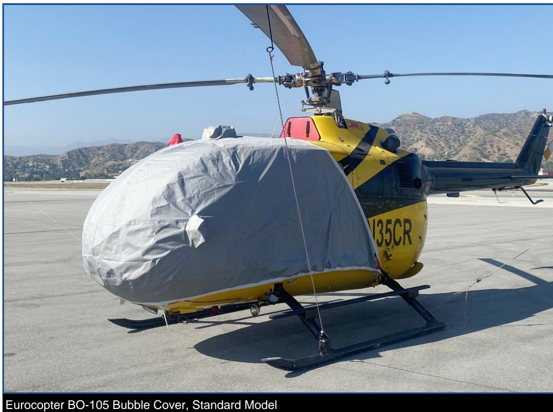
Eurocopter BO-105 Bubble Cover, Standard Model