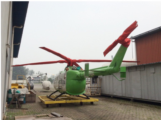
MBB BO-105 Blade, Rotor Head & Tail Rotor Covers