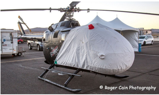
MBB BO-105 Bubble Cover