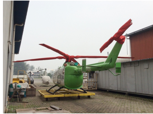
MBB BO-105 Blade, Rotor Head & Tail Rotor Covers