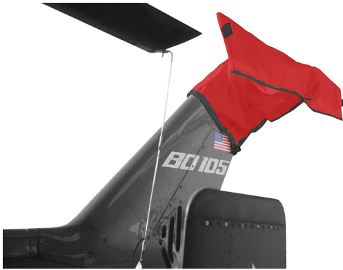
MBB BO-105 Tail Rotor/Gearbox Cover

WINTER USE MATERIAL - Made with Solution-Dyed Polyester fabric, this option is intended for seasonal use to aid in deicing, rain mitigation, or for occasional travel. The material is lighter and more compact, but more susceptible to UV damage and may have a shorter useful life if used continuously outside than the all-year use material.