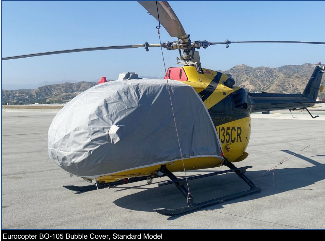
Eurocopter BO-105 Bubble Cover, Standard Model