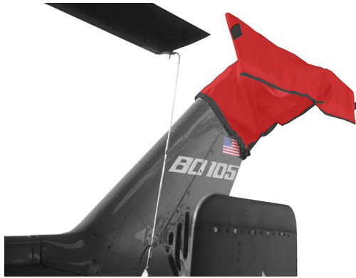
MBB BO-105 Tail Rotor/Gearbox Cover

WINTER USE MATERIAL - Made with Solution-Dyed Polyester fabric, this option is intended for seasonal use to aid in deicing, rain mitigation, or for occasional travel. The material is lighter and more compact, but more susceptible to UV damage and may have a shorter useful life if used continuously outside than the all-year use material.