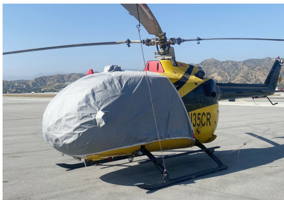
Eurocopter BO-105 Bubble Cover, Standard Model

The Engine Inlet Plugs are custom fit for your Eurocopter BO-105 intakes, made with heavy-duty vinyl material, and stuffed with a single block of sculpted urethane foam. Each plug has a zipper that allows the foam to be removed and dried if necessary. Engine plugs have 'Remove Before Flight' streamers sewn onto the face of the plugs. Most plugs are imprinted with the aircraft registration number in black for an extra charge. Storage bag NOT included. Engine plugs may be inserted after flight when the engine is still warm. Engine Inlet Plugs are commonly referred to as Cowl Plugs, Intake Plugs, Cowl Blocks, Engine Blocks, and Engine Bungs.