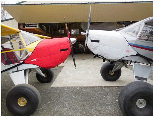
Avid Insulated Engine Covers