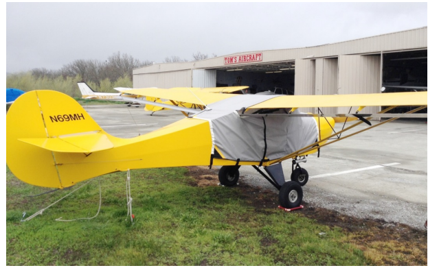
Avid Flyer Extended Canopy Cover