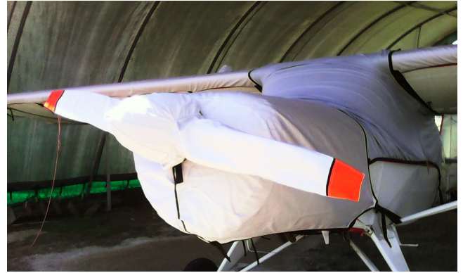
Auster J5 Canopy, Engine, and Propellor Covers