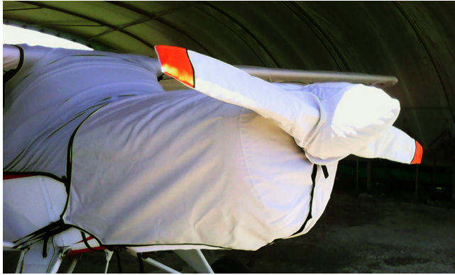
Auster J5 Canopy, Engine, and Propellor Covers