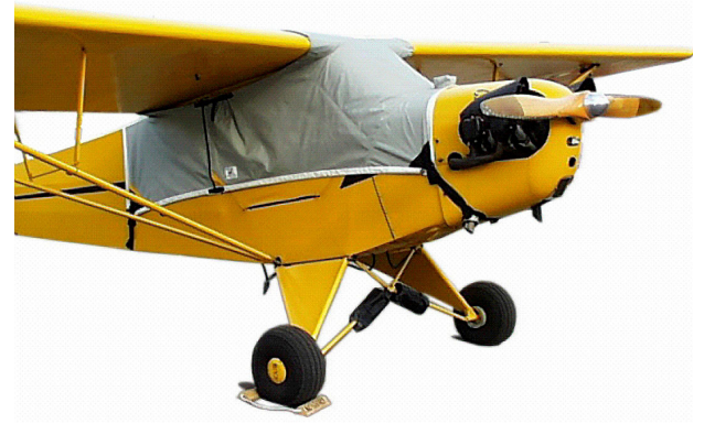
Piper J3 Canopy Cover