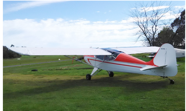
Auster J5 Autocar Wing Covers