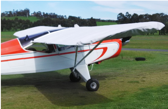
Auster J5 Autocar Wing Covers

WINTER USE MATERIAL - Made with Solution-Dyed Polyester fabric, this option is intended for seasonal use to aid in deicing, rain mitigation, or for occasional travel. The material is lighter and more compact, but more susceptible to UV damage and may have a shorter useful life if used continuously outside than the all-year use material.