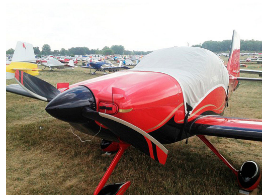
Van's RV-7 Canopy Cover & Engine Inlet Plugs