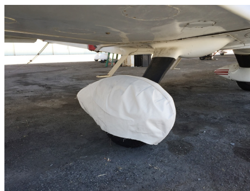
Grumman AA5 Main Wheelpant Cover, test fit