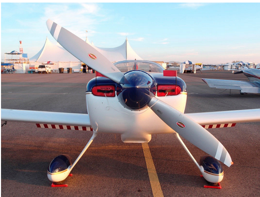
Van's RV-7 Engine Inlet Plugs

Engine Inlet Plugs are custom fit for your Aura Aero Integral R intakes, made with heavy-duty vinyl material, and stuffed with a single block of sculpted urethane foam. Each plug has a zipper that allows the foam to be removed and dried if necessary. Engine plugs have warning flags that are visible from the cockpit or 'remove before flight' streamers sewn onto the face of the plugs. Most plugs are imprinted with the aircraft registration number in black for an extra charge. Storage bag NOT included. Engine plugs may be inserted after flight when the engine is still warm. Engine Inlet Plugs are commonly referred to as Cowl Plugs, Intake Plugs, Cowl Blocks, Engine Blocks, and Engine Bungs.