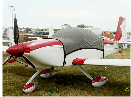
Van's RV-9 Travel Canopy Cover