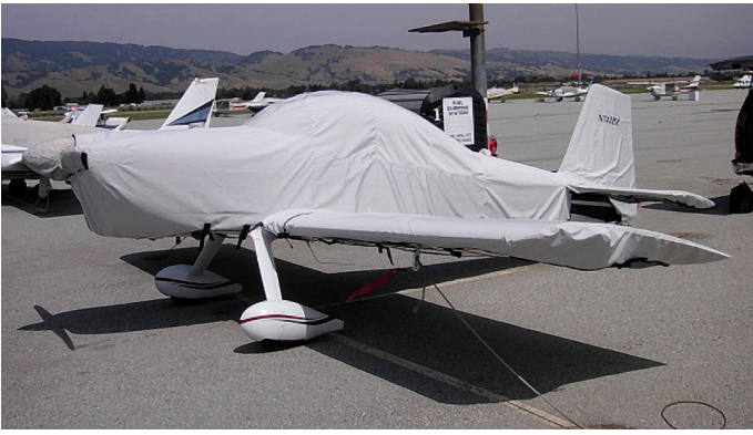
Van's RV-8 Complete Fuselage Cover w/ Detachable Wing Covers & Prop Cover