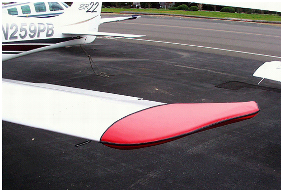
Cirrus SR-22 Wingtip Pad (also available for the Horiz. Stab.)

Designed to prevent damage to the aircraft extremities in crowded hangars, these products are made of bright red Naugahyde and thickly padded with a sandwich of closed cell foam.