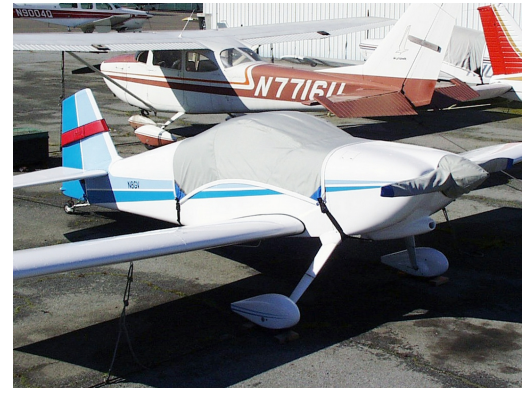
Vans's RV-6 Canopy Cover, Prop Cover